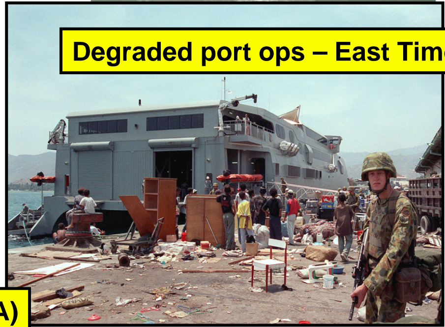
Degraded port ops – East Timor