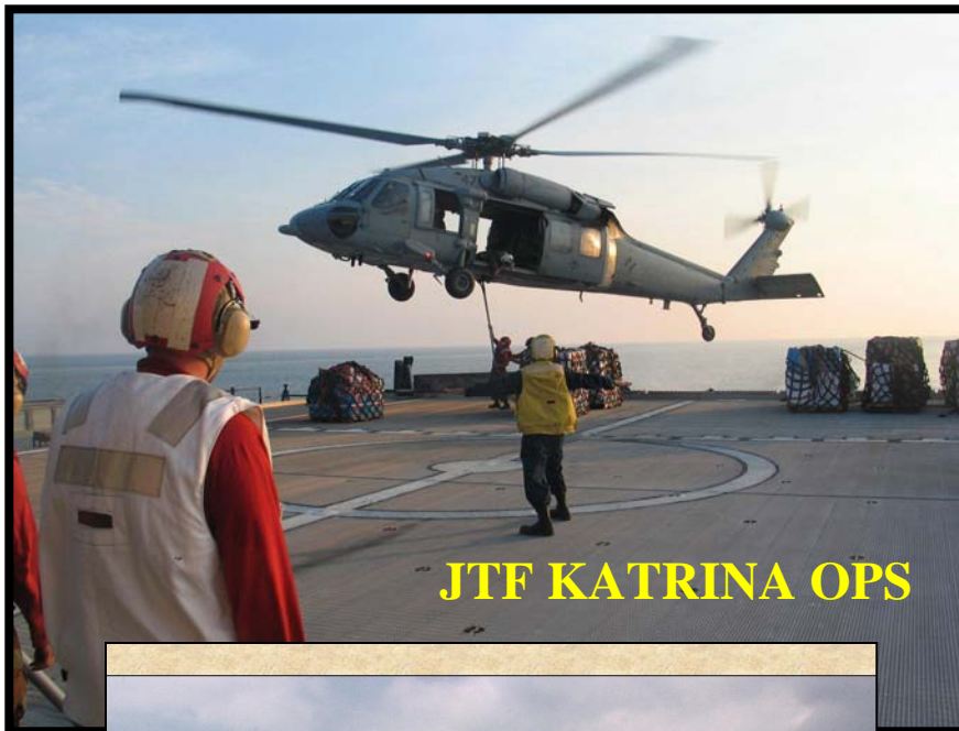
JTF KATRINA OPS