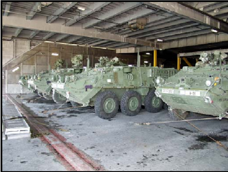
Maneuver of mechanized units