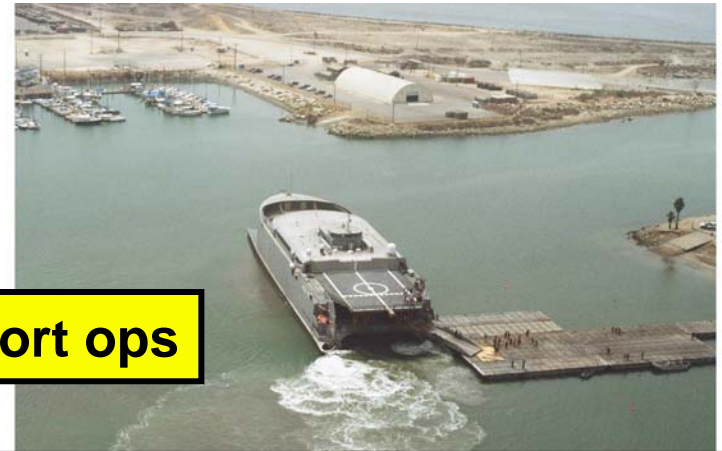
Austere port ops