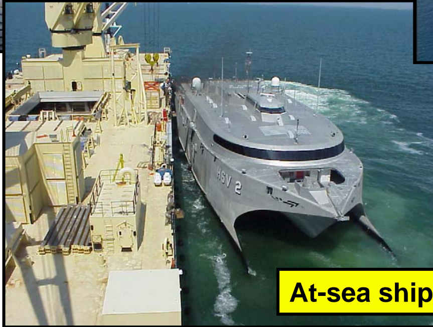
At-sea ship-to-ship transfer