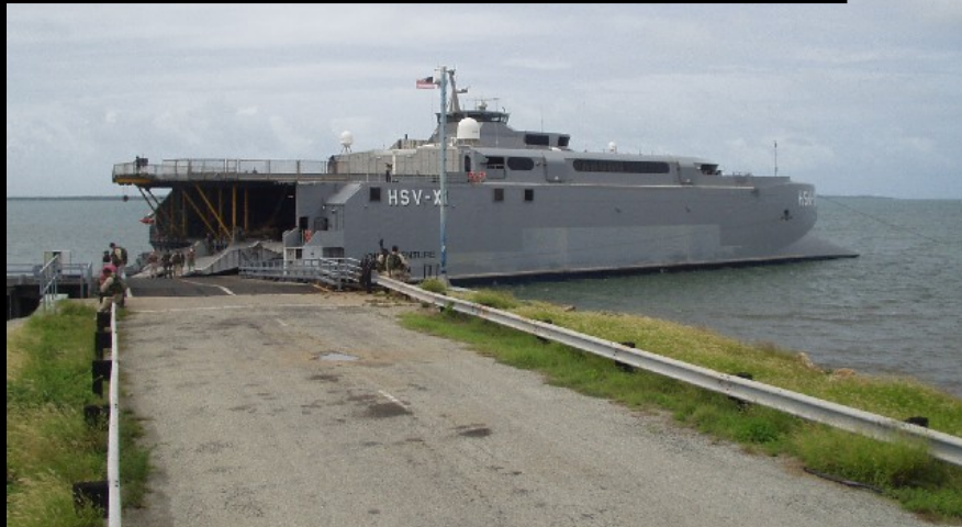
Quay wall offload – Kenya (JTF HOA)