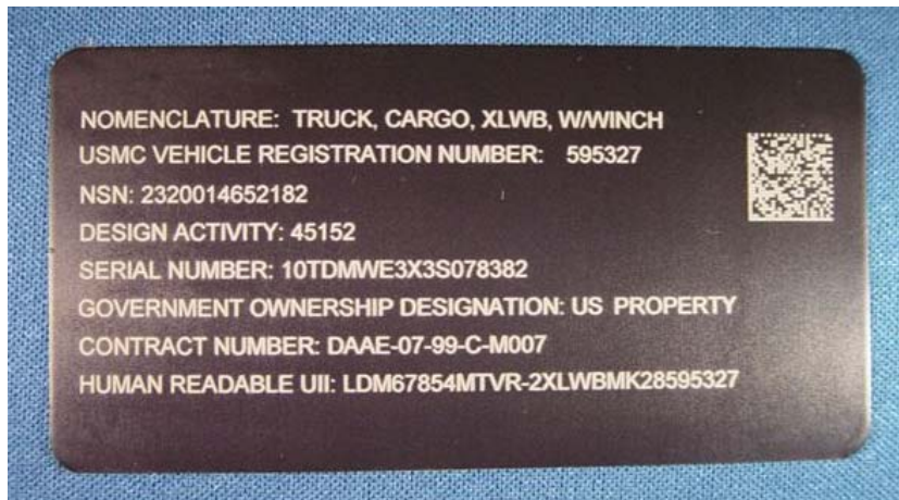
Figure 4. Example of an Anodized Aluminum Data Plate

Due to the durability and unyielding properties of the plate, many IUID pilot projects have experienced success employing anodized aluminum data plates. For example, the MCPP-N pilot program tested an anodized data plate 19 (Figure 4) manufactured by Monode Marking Products, Inc. that incorporates an inorganic dye as opposed to the commonly used organic dye variant. Consequently, the data plate excels in extreme operating temperatures and boasts abrasion- and fade-resistant attributes that are superior to the organic dye variant.