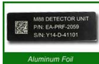
Figure 5. Example of an Anodized Aluminum Foil Data Plate

This category includes those few areas that do not contain enough flat space for a standard data plate (e.g., main gun). Anodized aluminum foil is available in a range of thicknesses and is ideal for curved areas because of its inherent flexibility. Even though it is not as rigid as standard data plates, the anodizing process provides the same industrial benefits such as resistance to chemicals, abrasion, and high temperatures. Figure 5 is an example of an anodized aluminum foil IUID data plate (UID Label & Beyond LLC, 2008).