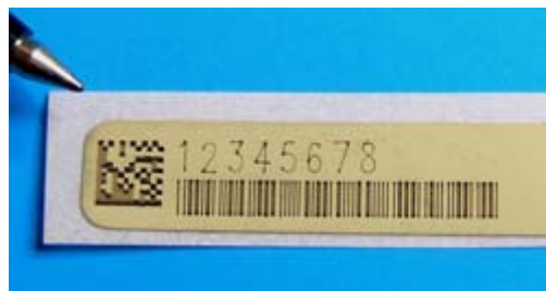
Figure 6. Example of a Polyimide Data Label

The final category includes items such as cables and wire harnesses. Polyimide labels—which are superior to polyester—offer greater tear resistance through high tensile strength and are frequently utilized in the circuit board industry in which product labeling must withstand high temperatures and various solvents. As illustrated in Figure 6, high-contrast readable text and a 2D matrix can be created on a polyimide label with just 10 watts of a CO 2 laser (Synrad, 2007).