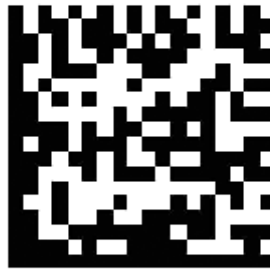
Figure 2. Example of 2D Data Matrix (OUSD [AT&L], 2006a, p 33)

Items in the DoD inventory that meet the IUID criteria are required to be marked with a two-dimensional (2D) data matrix symbol, shown in Figure 2.