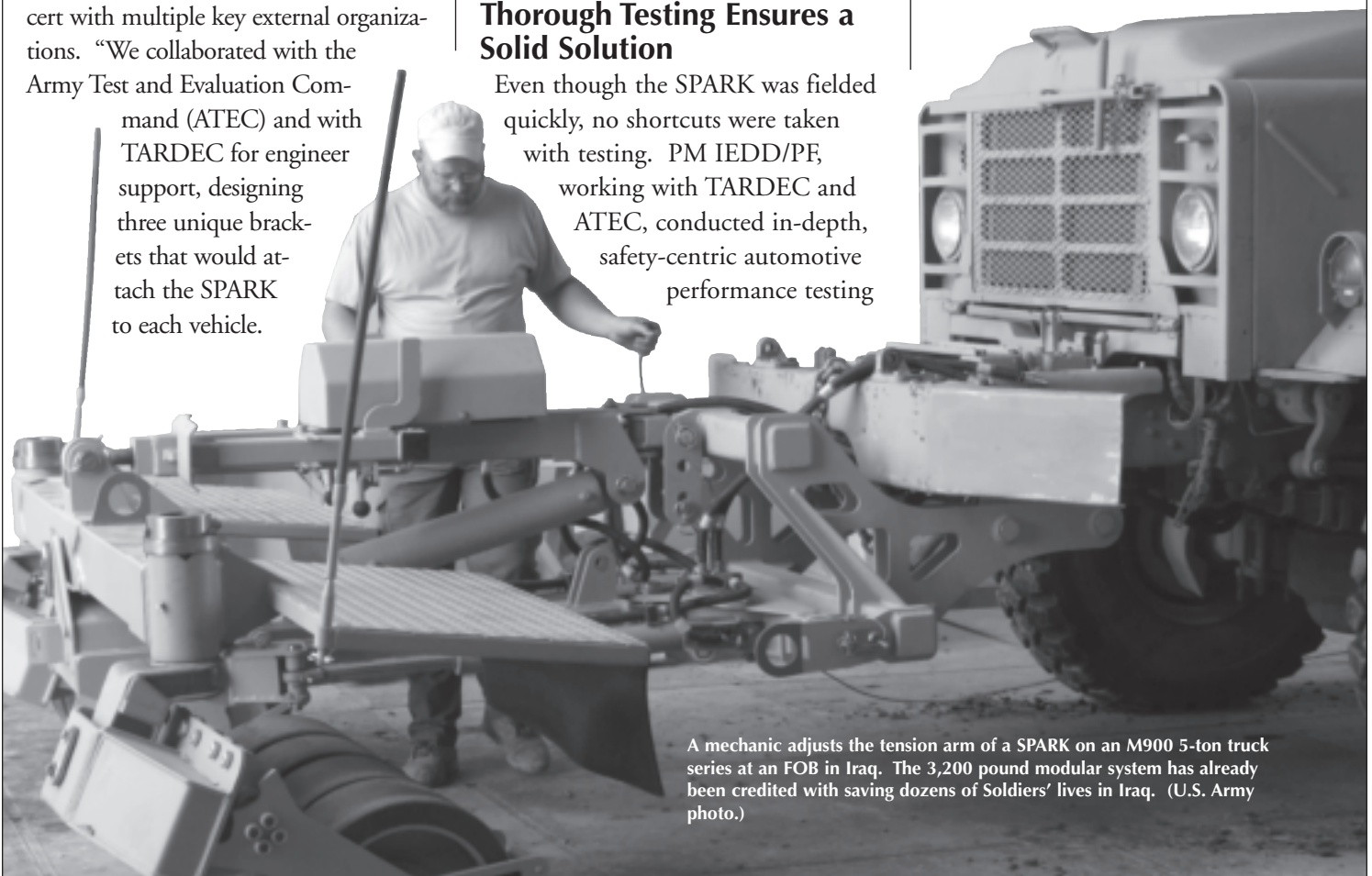
A mechanic adjusts the tension arm of a SPARK on an M900 5-ton truck series at an FOB in Iraq. The 3,200 pound modular system has already been credited with saving dozens of Soldiers' lives in Iraq.

went through a successful blast test attached to the HMMWV.