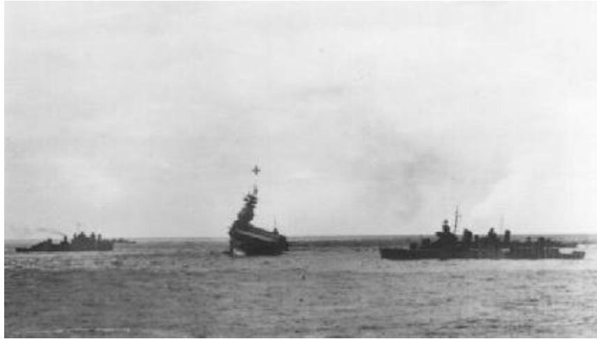
The American aircraft carrier Yorktown lists after being struck repeatedly by Japanese carrier aircraft during the Battle of Midway. Although it was in danger of capsizing and abandoned by its crew, a small volunteer salvage party aboard Yorktown had managed to stabilize the vessel. It was about to be taken under tow when a Japanese submarine sank it.

Yorktown proved scant compensation. The Americans could replace the Yorktown while Japanese naval power had been sustained a mortal wound because they could not replace the four aircraft carriers they lost in the battle.