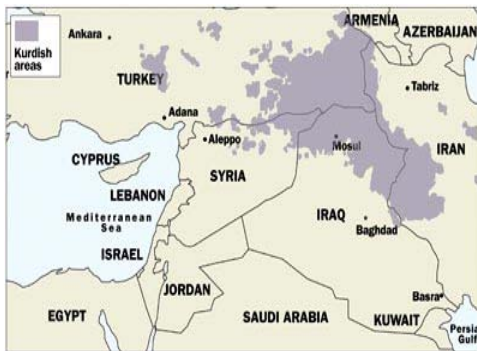
Map 1: Kurdish population demographic 2002

The post-war border drawn between British-mandated Iraq and Turkey created significant friction as this historically Kurdish region was partitioned along the borders of four separate states: Turkey, Iraq, Syria, and Iran. 4 Kurds generally refer to this entire, multi-state region as “Kurdistan.” 5 Although Turkey has the largest Kurdish population, nearly five million Kurds live in Iraq—the majority of whom live in Iraqi Kurdistan. (See map 1).