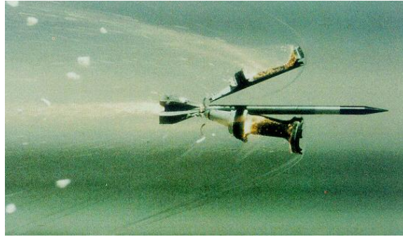
Figure 3: A representation of the final stage of sabot separation from the penetrator. 59

Arsenal and BRL also produced a series of designs for the sabot focusing on exact shape of the scoops or ramps. The final double ramp sabot shape used on the M829 was the result of computer modeling by BRL. 60