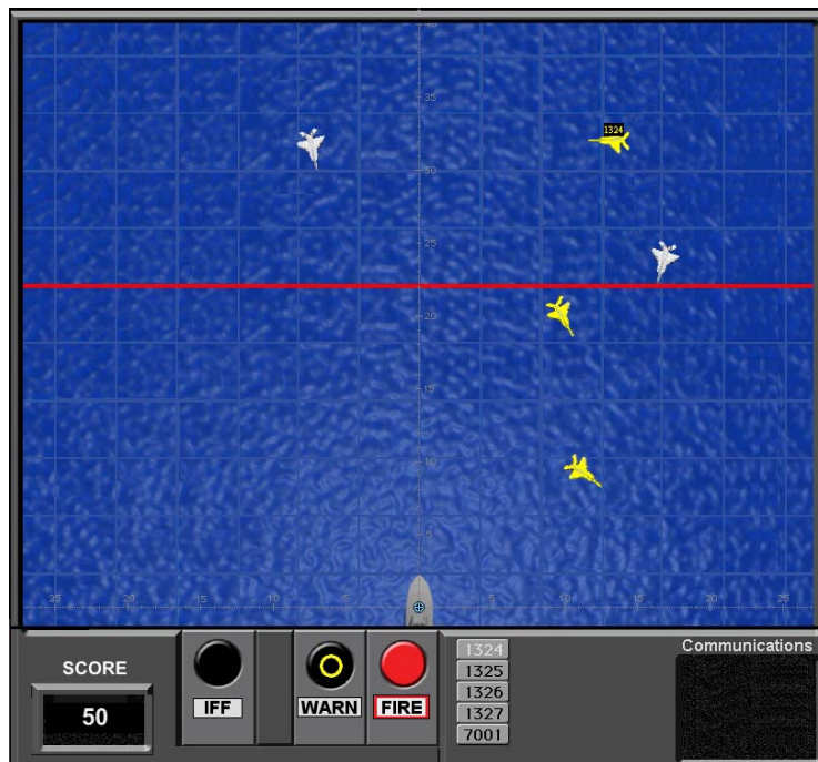
Figure 1. Screen shot of the Airspace Monitoring task in Warship Commander Task

For the TIE, the 20 cognitive state gauges were assigned to one of four data collection teams to create suites of gauges that could simultaneously monitor participants as they performed the task. This arrangement was done to: 1) assess compatibility issues among the different gauge technologies, 2) allow the direct comparison of results using the different gauges within a team as they assessed the cognitive state changes of the same participants at the same time, yet 3) allow the use of similar sensor technologies, across teams, that would otherwise compete for access to the same physical locations on test participants.