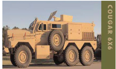
Figure 3. Cougar 6x6

JERRV. MCSC awarded three sole-source contracts to FPI for the JERRV. In May 2005, MCSC became the procuring service for the Cougar for all military services, and the Cougar became a joint service vehicle known as the JERRV. In May 2005, MCSC awarded a sole-source contract to FPI for 122 JERRVs. In May 2006, MCSC awarded a second sole-source contract to FPI for 79 JERRVs. In mid-November 2006, MCSC awarded a third sole-source contract to FPI for 200 JERRVs as part of the MRAP program. MCSC also procured 80 Buffalos under this contract. During our visit in late November 2006, a program official stated that MCSC planned to compete future contracts for the JERRV.