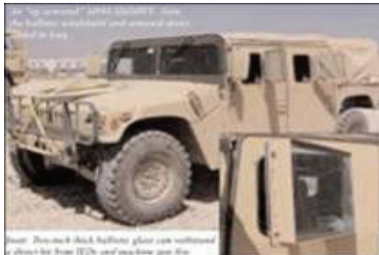
Figure 4. Armored HMMWV

On September 29, 2006, DoD IG issued a report 10 on commercial contracting that addressed the Army's armored HMMWV contract with OHEAC. The report concluded that the Army did not provide adequate documentation to justify the