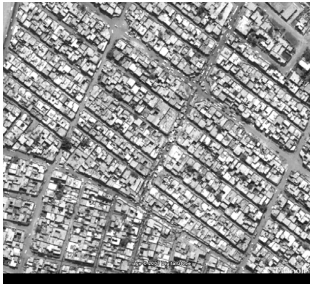
Figure 2. Baghdad Overhead View

as well. While targeting pods have the capability to magnify the target area, the area of interest still has to be found. Fortunately, when available, the use of transmitted target and friendly coordinates, can drastically simplify this target acquisition process.