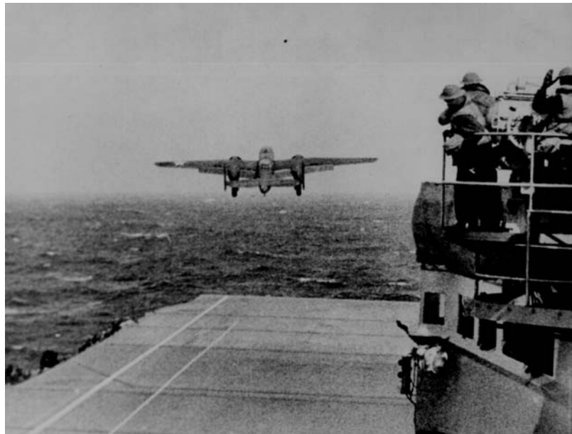
(A B-25 bomber taking off from USS Hornet in April 1942)

successfully unbalanced the Japanese strategic centers of gravity, and quickly forced their military planners to alter their entire war strategy. After the Doolittle Raid, the Japanese dramatically deviated from their previous courses of war, and shifted their operational centers of gravity. Instead of going further south of Indochina region, they hastily attacked the Island of Midway. At the end of the Battle of Midway, the formerly victorious Japanese Imperial Navy lost four aircraft carriers and three thousand veteran aviators and seamen. It was not only great losses for Japan, but also was the turning point of the Pacific War which led to Japan's total defeat at the end of WWII. This shows that, having achieved strategic superiority, we can win the war without fighting necessary battles.