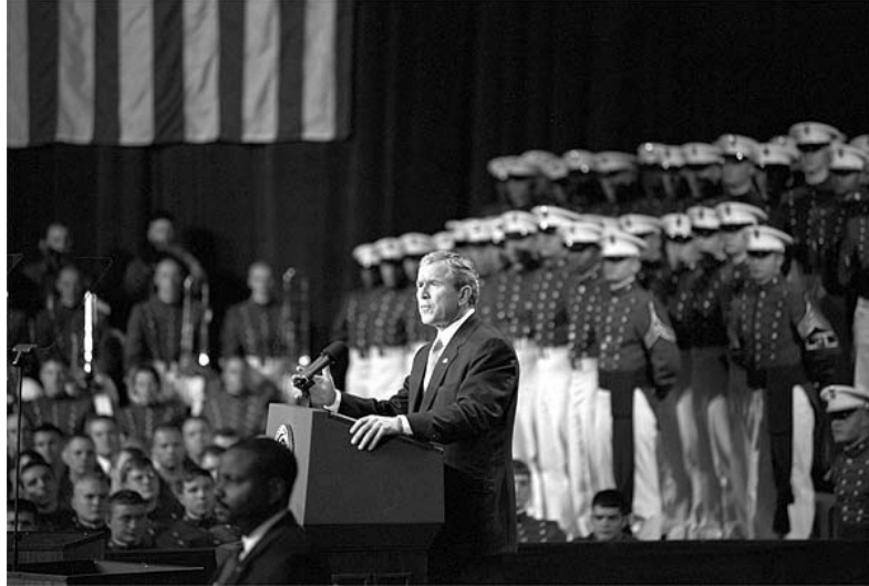
(President George W. Bush addressing on GWOT at the Citadel)

In the speech to the cadets at the Military College of South Carolina (also known as the Citadel) in 2002, U.S. President George W. Bush put forth the challenge that the U.S. military must adapt different mindset in order to fight and win the long war. He clearly stated: