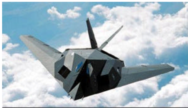
Figure 8: US Air Force F-117 Nighthawk.

This PBL contract, termed by the Air Force as Total System Performance Responsibility (TSPR), codifies an acquisition strategy that has a single contractor manage all elements of a system to ensure that the entire system meets performance requirements. How the contractor meets the broad performance requirement is at their general discretion. The 1998 contract with Lockheed Martin Corporation included depot maintenance, engineering technical assistance, logistics support, spare parts administration, and subcontractor management. The contract required the contractor to maintain a mission capable rate on the aircraft, and also provided for