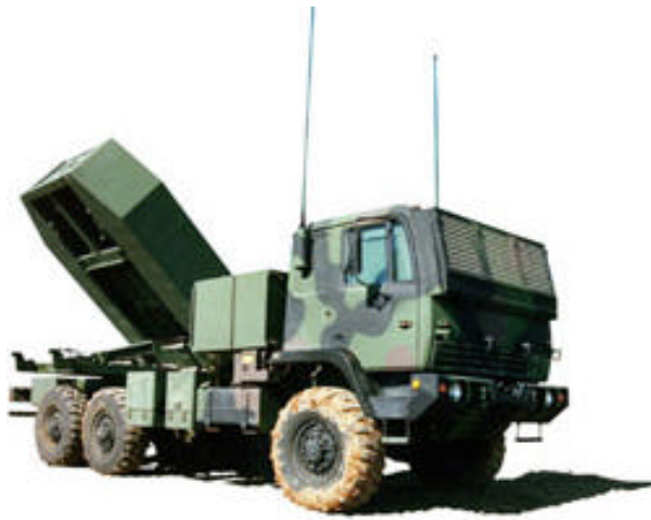
Figure 7: US Army HIMARS Launcher.

sustainment engineering, readiness monitoring and program oversight. The performance metrics are System Status Readiness (SSR), Mission Capable (MICAP) parts requisition time, and repair turnaround time. SSR metric is a measure of the system availability driven by failures of over 1600 contractor managed items. MICAP is a measure of supply chain response for mission critical components. Repair turnaround time is a measure of the