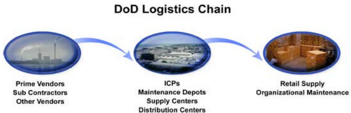
Figure 1: DoD Logistics Chain.

delivery of finished products to the end user. Vendors, service providers, and customers are links in the supply chain” [5]. The same regulation defines SCM as, “the management of all internal and external logistics processes, information, and functions necessary to satisfy a customer’s requirement. The management of the interdependent logistics processes of customer response, inventory planning and management, warehouse management, transportation, supply, maintenance, and reverse logistics” [6]. Figure 1 and Figure 2, from the Defense Acquisition University SCM module [7], illustrate the DoD supply chain and describe SCM as the “process of implementing and controlling the efficient, cost efficient flow and storage of raw material, inventory, finished goods and related information from point of origin to consumption” [8].