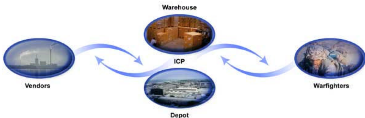
Figure 2: Supply Chain Management.

Process of planning, implementing, and controlling the efficient, cost effective flow and storage of raw materials, inventory, finished goods and related information from point of origin to consumption .