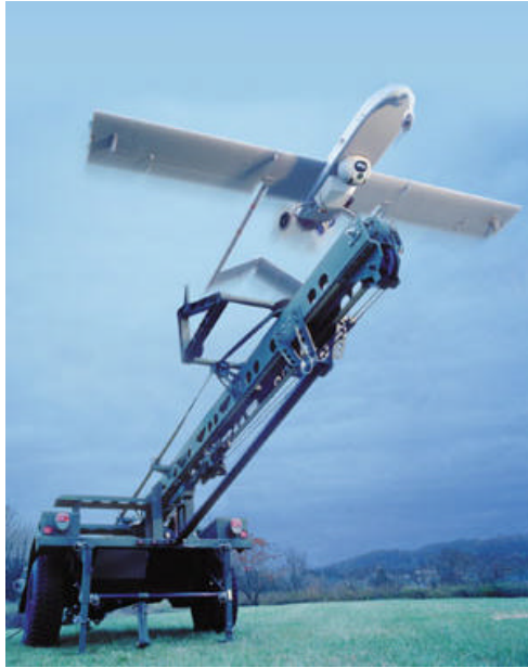
Figure 6: US Army Shadow TUAV.

arrangement is on a cost-plus incentives contract where the contractor and Government share in the benefits of improved performance. The goal is to transition more performance risk to the