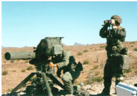
Figure 5: US Army TOW ITAS.

The Army awarded in December 2001 a five-year PBL contract to the original equipment manufacturer (OEM). The contract was fixed-price, fixed-fee, with performance adjustments for increases in Operational Readiness rate above a certain level. The PBL arrangement has supported multiple deployments in Iraq and Afghanistan.