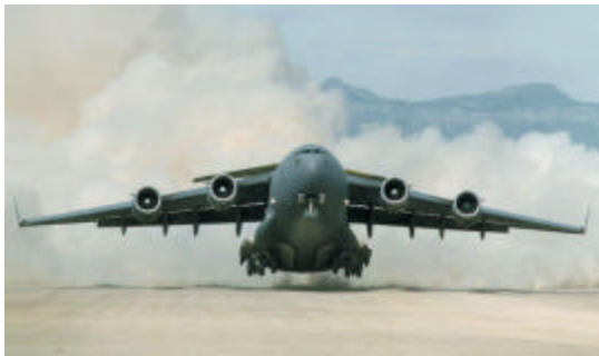
Figure 4: US Air Force C-17 Globemaster.

Boeing is the PSI for the C-17 PBL arrangement, carrying what the Air Force calls “Total System Support Responsibility” (TSSR). Boeing’s TSSR role encompasses item management and depot level repair of the C-17 airframe and subcomponents. The TSSR arrangement is full-spectrum and includes program management, depot maintenance, equipment repair, supply management, and sustainment engineering functions.