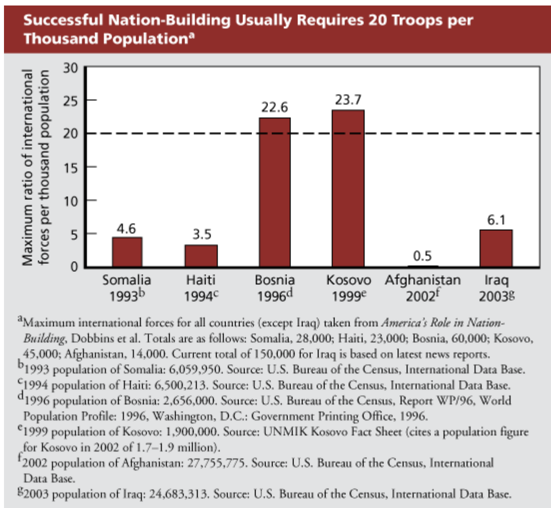
Figure 2. Troop Density Required for Successful Nation-Building 21

higher. Although numbers alone do not constitute a security strategy, many successful strategies for population security and control have required force ratios either as large as or larger than twenty security personnel (troops and police combined) per thousand inhabitants. This figure is roughly 10 times the ratio required for simple policing of a tranquil population. 20 For this study, the authors use the 20-per-1000 ratio as comparative tool that helps to place the counterinsurgency operations in Mosul, Ramadi and Samarra in historical context. We do not declare this to be a historical standard that must be met. Rather, given the experience of several past conflicts, this thesis seeks to determine how the current operation in Iraq compares.