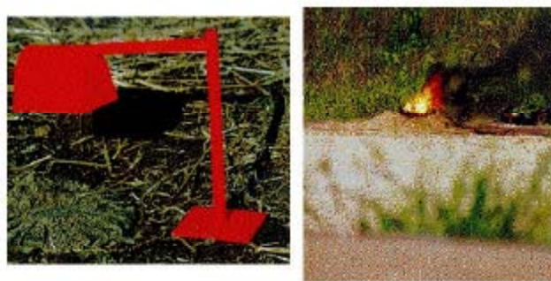
Figure 2: REMIC device on the left, and burning AT landmine following REMIC initiation.

cord with the REMIC suspended above the mine at a specified standoff distance with a monopod support (Figure 2). Once the device is initiated remotely, it produces a high velocity jet, which cuts the mine case. Next, hot gas from the jet breaks the chemical reservoirs and the chemical enters the mine. The chemical reacts pyrologically with the explosive, causing the explosive to start burning. The burning reaction is self-sustained and will not transition to high-order unless a fuze or detonator reacts to the