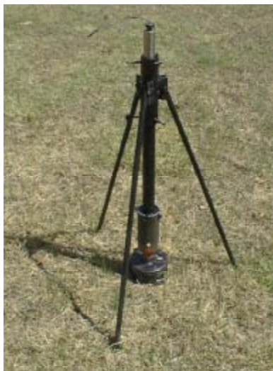
Figure 1b: BCC - Improved Tripod

above the mine. The chemical-filled (60 mL) plastic bottle is secured inside a quick-disconnect reducer assembly at the bottom of the gun tube. Once the squib is fired, it produces gas pressure, driving a hammer to impact a firing pin, which in turn fires a cartridge. The bullet penetrates the