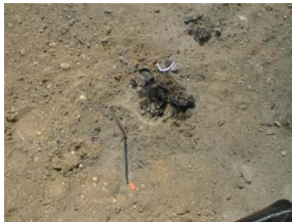
Figure 4: Before and after: Large REMIC-II positioned over a VS-50 AP Landmine, and the completely burned mine after REMIC application.

stake mines. To neutralize a mine, the device is placed above the explosive section of the mine at standoff distance, 15 to 20 cm depending on the thickness of the mine case (Figure 4). An electric cap is used to initiate the device remotely. Once the device is initiated, the EFP perforates the mine casing via hydrodynamic erosion. The explosive by-products of the cutting charge, in turn, fracture the reservoir tubes and direct the chemicals into the mine to initiate burning. The large REMIC-II can penetrate steel-cased mines up to 1.27 cm thick. However, the penetration force that accomplishes this can pulverize or cause high order detonation in mines with cases that are not so thick. To control the penetration performance of the EFP, and thereby increase effectiveness against thinner case mines, the large REMIC device uses one of 4 stripper plates depending on the thickness of the target mine case. The width of the opening of the stripper plate determines the degree of disruption of the