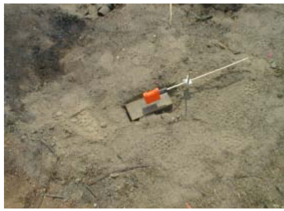
Figure 3: Small REMIC-II positioned over a PMD-6 AP Mine.

a holder that accepts the blasting cap and hold it firmly in place. Once the electric cap is initiated with a demolition device, the linear shaped charge jet perforates the mine casing, while the explosive by-products of the cutting charge fracture the reservoir tubes and direct the chemicals into the mine. Once the binary chemicals combine inside