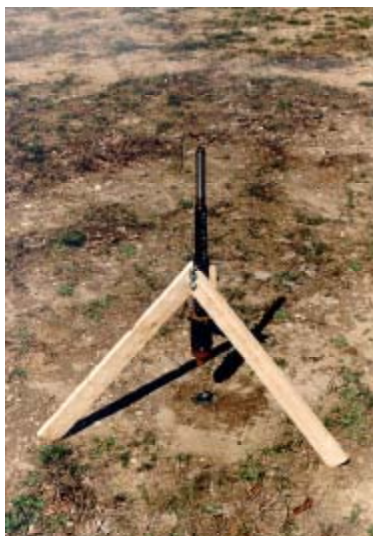
Figure 1a: Original BCC Design

depending on the size and type of explosive, and type of mine case. The prototype design is robust. It can be operated remotely and it is reusable (Figures 1a and 1b). Remote operation is by an electric squib, and a tripod for positioning the delivery device