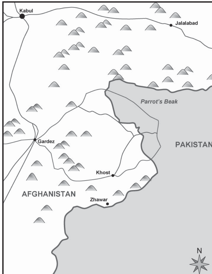
MAP 4. PARROT'S BEAK REGION ON AFGHANISTAN / PAKISTAN BORDER.

guerillas. Tactics included carpet bombing of agricultural regions and wholesale destruction of villages. The Soviets have created a 30-mile deep no-man's-land on the border with Pakistan. This has led to widespread food shortages and destroyed the guerillas' infrastructure in many regions. Soviet commando operations and air strikes against guerrilla caravans bringing in CIA-provided military supplies have forced