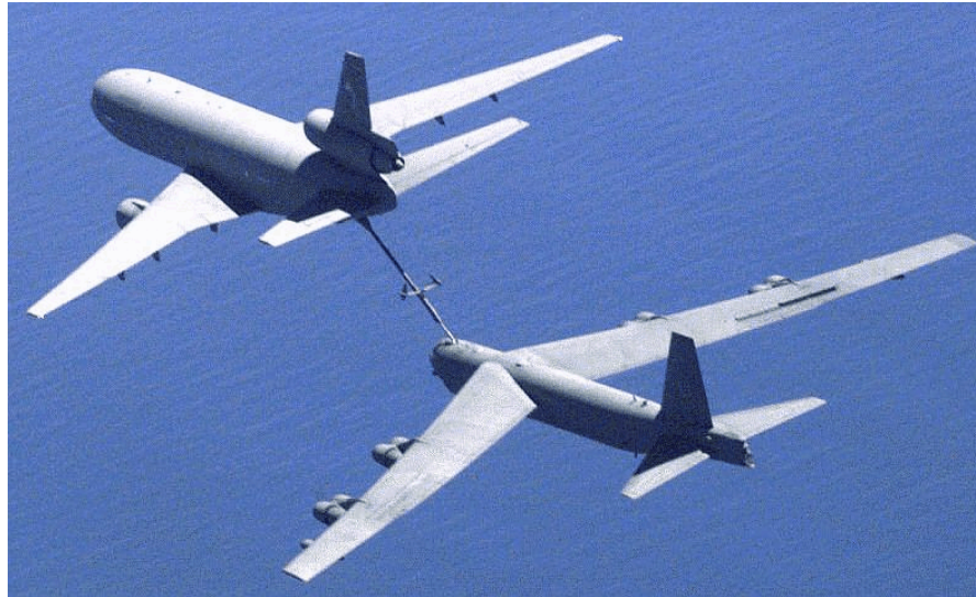
Figure 1. USAF KC-10 Refueling B-52 with Flying Boom

Air Force helicopters, and all Navy and Marine Corps aircraft refuel using the “hose-and-drogue.” NATO countries and other allies also refuel with the hose-and-drogue. As its name implies, this refueling method employs a flexible hose that trails from the tanker aircraft. A drogue (a small windsock) at the end of the hose stabilizes it in flight, and provides a funnel for the aircraft being refueled, which inserts a probe into the hose. ( Figure 2 ). All boom-equipped tankers (i.e., KC-135, KC-10), have a single boom and can refuel one aircraft at a time with this mechanism. Many tanker aircraft that employ