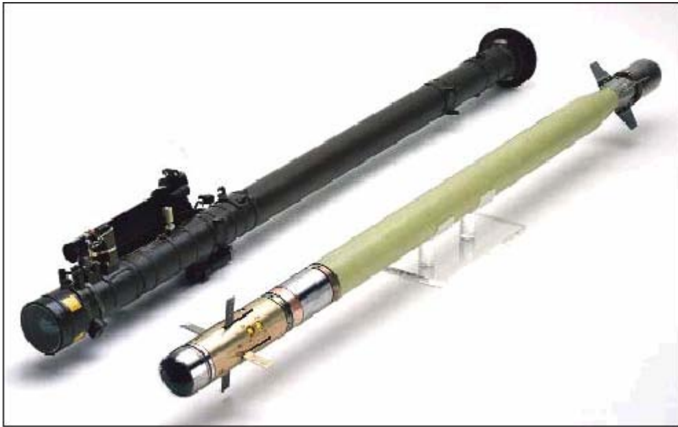
Figure 1. Stinger launch tube assembly (left) and Stinger missile round. 14

The Stinger is a heat-seeking, man-portable, air defense (MANPAD) missile. 11 The system consists of a reusable grip stock and a sealed launch tube with a five-foot-long missile. The grip stock and missile tube together weigh about 35 pounds. The weapon has a maximum altitude of about 10,000 feet, and a range of about five miles. Over 44,000 Stingers have been built. It is used by the U.S. Army (which plans to keep it in the inventory until at least 2018), the Marine Corps, and the Navy. 12 It is also used by numerous foreign nations. 13