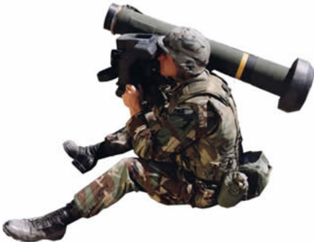
Figure 4. The Javelin gunner looks through the CLU. 55