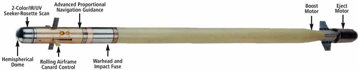
Figure 2. Stinger missile round. 15