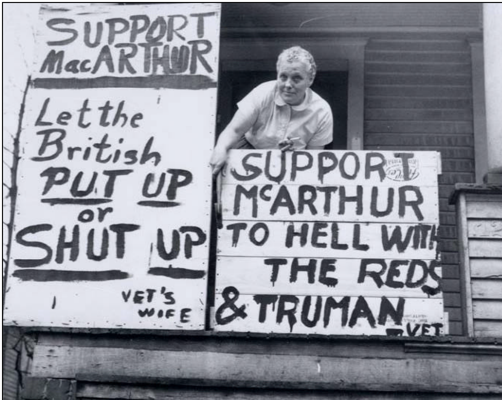
Protest of General MacArthur's Dismissal (, Youngstown Ohio, 13 Apr 51)