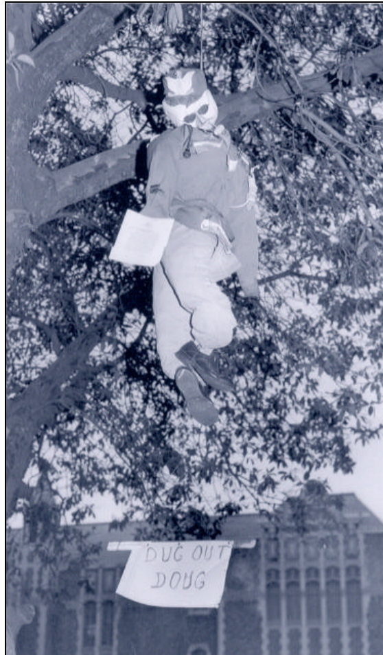
The General Hangs at Dawn (, Seattle, Washington, 13 Apr 51)

Truman announced the discharge of MacArthur, he told his White House staff that the general, like George B. McClellan in the 1860s, “worked with the minority to undercut the administration when there was a war on.” The next day, the New York Herald Tribune summarized the progression of events quite perceptively: “The most obvious fact about the dismissal of General MacArthur is that he virtually forced his own removal.” 30