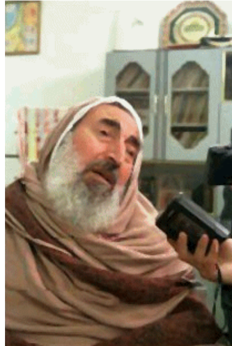
Sheikh Ahmed Yassin