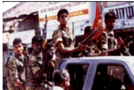
LTTE child soldiers

The majority of the rank and file membership belong to the lower middle class. Almost all LTTE cadres have been recruited from the lower-caste strata of Jaffna society. The Tamil Tigers draw their recruits from the Tamils who live in the northern province and some from the eastern province. The cadres drawn from other