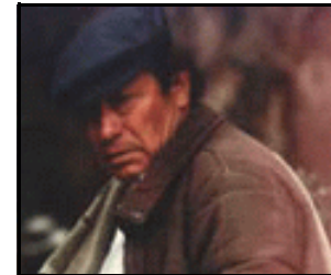
Pedro Antonio Marín

Background: Since its inception in May 1966, the FARC has operated under the leadership of Pedro Antonio Marín (aka “Manuel Marulanda Vélez” or “Tirofijo”—Sure Shot). Marín was born into a peasant family in Génova, Quindío Department, a coffee-growing region of west-central Colombia. He says he was born in May 1930, but his father claimed the date was May 12, 1928. He was the oldest of five children, all brothers. His formal education consisted of only four years of elementary school, after which he went to work as a woodcutter, butcher, baker, and candy salesman. His family supported the Liberal Party. When a civil war erupted in 1948 following the assassination of a Liberal president, Marín and a few cousins took to the mountains. On becoming a guerrilla, Marín adopted the pseudonym of Manuel Marulanda Vélez in tribute to a trade unionist who died while opposing the dispatch of Colombian troops to the Korean War.