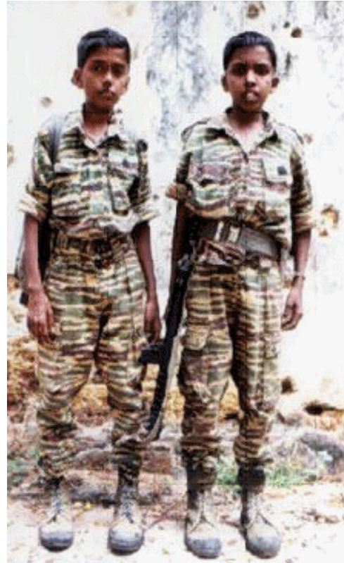
LTTE child combatants

Among the world’s child combatants, children feature most prominently in the LTTE, whose fiercest fighting force, the Leopard Brigade (Sirasu puli), is made up of children. In 1983 the LTTE established a training base in the state of Pondicherry in India for recruits under 16, but only one group of children was trained. By early 1984, the nucleus of the LTTE Baby Brigade (Bakuts) was formed. The LTTE trained its first group of women in 1985. In October 1987, the LTTE stepped up its recruitment of women and children and began integrating its child warriors into other units. LTTE leader Prabhakaran reportedly had ordered the mass conscription of children in the remaining areas under LTTE control, especially in the northeastern Mullaittivu District. From late 1995 to mid-1996, the LTTE recruited and trained at least 2,000 Tamils largely drawn from the 600,000 Tamils displaced in the wake of the operations to capture the peninsula. About 1,000 of these were between 12 and 16 years old. In 1998 Sri Lanka’s Directorate of Military Intelligence estimated that 60 percent of LTTE fighters were below 18 and that a third of all LTTE recruits were women. According to an estimate based on LTTE fighters who have been killed in combat, 40 percent of LTTE’s force are both males and females between nine and 18 years of age. Since