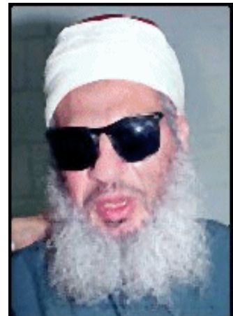
Sheikh Omar Abdel Rahman

Background: Omar Abdel Rahman was born in 1938, blinded by diabetes as an infant. He became a religious scholar in Islamic law at Cairo’s al-Azhar University. By the 1960s, he had become increasingly critical of Egypt’s government and its institutions, including al-Azhar University, which he blamed for failing to uphold true Islamic law. One of the defendants accused of assassinating Egyptian President Anwar Sadat on October 6, 1981, Dr. Abdel Rahman was considered an accessory because of his authorization of the assassination through the issuance of a fatwa or Islamic judicial decree, to the assassins. However, he was acquitted because of the ambiguity of his role. In the 1980s, made unwelcome by the Egyptian government, he traveled to Afghanistan, Britain, Pakistan, Saudi Arabia, Sudan, Switzerland, and the United States, exhorting young Muslims to join the mujahideen to fight the Soviets in Afghanistan. Sheikh Abdel Rahman’s activities also included leading a puritanical Islamic fundamentalist movement (Al Jamaa al Islamiyya) aimed at overthrowing the regime of President Hosni Mubarak. The movement’s methods included terrorist attacks against foreign tourists visiting archaeological sites in Egypt. The sheik has described American and other Western tourists in Egypt as part of a “plague” on his country.