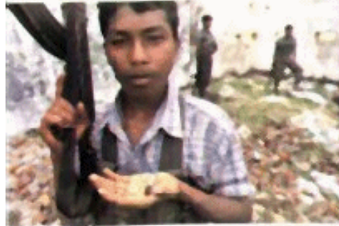
A LTTE child soldier with a cyanide capsule in his hand.

The LTTE has a female military force and uses some females for combat. Indeed, female LTTE terrorists play a key role in the force. An unknown number of LTTE's female commandos are members of the LTTE's elite commando unit known as the Black Tigers. Members of this unit are designated as "suicide commandos" and carry around their necks a glass vial containing potassium cyanide. Suicide is common in Hindu society, and the Tigers are fanatical Hindus. The cyanide capsule, which LTTE members view as the ultimate symbol of bravery and commitment to a cause, is issued at the final initiation ceremony. A LTTE commando who wears the capsule must use it without fail in the event of an unsuccessful mission, or face some more painful form of death at the hands of the LTTE. One of the first reported instances when LTTE members had to carry out their suicide vow was in October 1987, when the LTTE ordered a group of captured leaders being taken to Colombo to commit suicide.