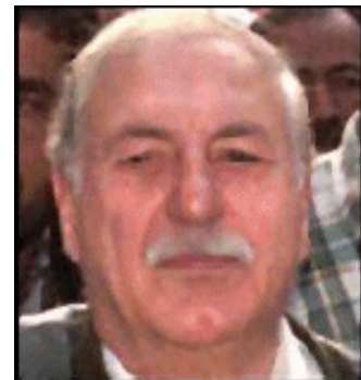
Ahmad Jibril

After a long period of suffering and poverty, Jibril had the good fortune in the mid-1970s of becoming acquainted with Libya's Colonel Muammar al-Qadhafi in the wake of the downing of a Libyan civilian plane by Israeli fighters over the Sinai. Jibril offered to retaliate, and Qadhafi reportedly gave him millions of dollars to buy gliders and launch kamikaze attacks on an Israeli city. After sending the pilots to certain communist countries for training in suicide missions, Jibril met with Qadhafi and returned the money, saying that twice that amount was needed. Impressed by Jibril's honesty, Qadhafi immediately gave him twice the amount.