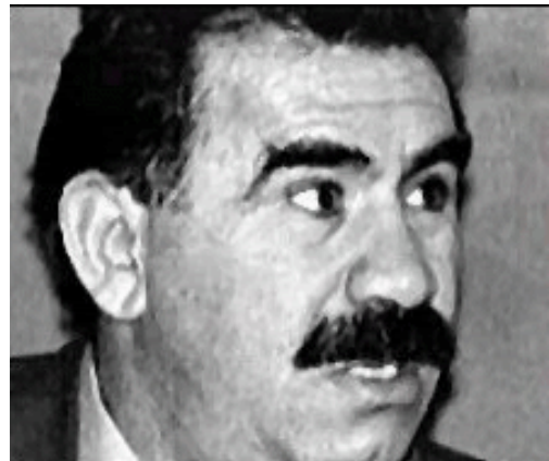
Abdullah Ocalan

The Kurdistan Workers' Party (Parte Krikaranc Kordesian/Partia Karkaris Kurdistan-PKK) originated in 1972 with a small group of Marxist-oriented university activists in Ankara known as "Apocus." The principal founder of the student-based Apocular group, Abdullah Ocalan ("Apo"—Uncle) was a former student (expelled) in political science at Ankara University, who was prominent in the underground Turkish Communist Party. Ocalan (pronounced Oh-ja-lan or URGE'ah-lohn) was born in 1948 in the village of Omerli in the southeastern Turkish province of Urfa, the son of an impoverished Kurdish farmer and a Turkish mother. In 1974 Apocus formed a university association whose initial focus was on gaining official recognition for Kurdish language and cultural rights. Over the next four years, Ocalan organized the association into the PKK while studying revolutionary theories. In 1978 he formally established the PKK, a clandestine Marxist-Leninist Kurdish political party. During his trial in June 1999, Ocalan blamed harsh Turkish laws for spawning the PKK in 1978, and then for its taking up arms in 1984. "These kinds of laws give birth to rebellion and anarchy," he said. The language ban—now eased—"provokes this revolt."