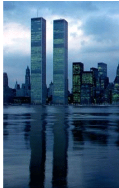
( www.GreatBuildings.com/buildings/World_Trade_Center.html )

Aum Shinrikyo's Shoko Asahara recruited a scientific team with all the expertise needed to develop WMD. Osama bin Laden also recruits highly skilled professionals in the fields of engineering, medicine, chemistry, physics, computer programming, communications, and so forth. Whereas the skills of the elite terrorist commandos of the 1960s and 1970s were often limited to what they learned in training camp, the terrorists of the 1990s who have carried out major operations have included biologists, chemists, computer specialists, engineers, and physicists.