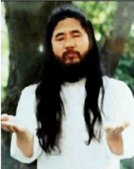
Shoko Asahara

To retain its membership, Aum Shinrikyo used mind-control techniques that are typical of cults worldwide, including brutal forms of physical and psychological punishment for various minor transgressions. New members had to terminate all contacts with the outside world and donate all of their property to Aum. This policy outraged the parents of Aum Shinrikyo members. In addition, in 1989 Aum Shinrikyo began to use murder as a sanction on members wishing to leave the sect.