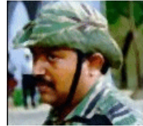
Velupillai Prabhakaran