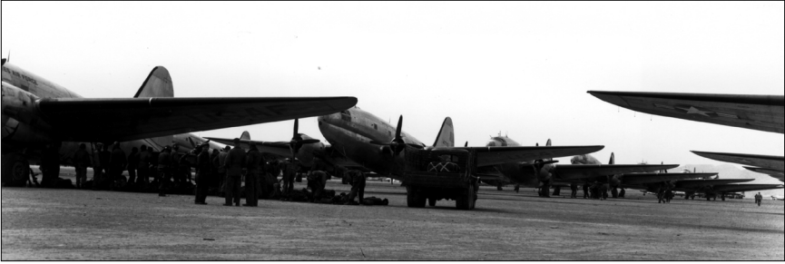
Paratroopers prepare to board C-46s for airdrop at Munsan, March 23, 1951.

On March 18, Eighth Army advised FEAF that D day would be March 22. Twenty-four hours before the planned drop, however, Chunchon fell to the swiftly moving U.N. forces. Eighth Army then switched the target to Munsan, 20 miles northwest of Seoul on the Imjin River, with the drop to take place on the morning of March 23.