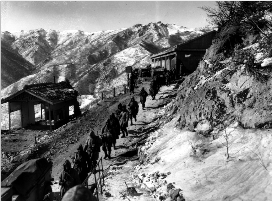
Marines gaze at the gap in the bridge over the Funchilin Pass that must be spanned to permit them to bring out their equipment. The next day, December 10, 1950, the men are crossing on the treadway bridge that was airdropped to them and that they have installed overnight.