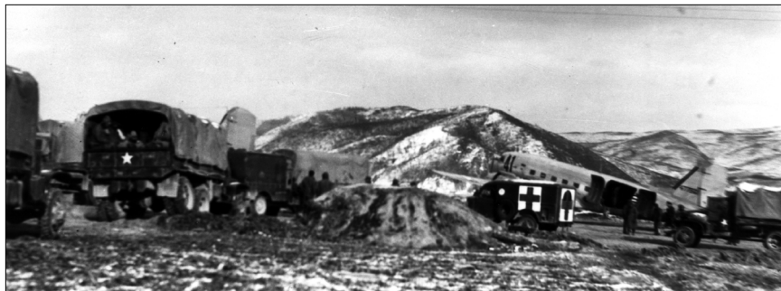
Casualties being loaded aboard Combat Cargo C-47s at Hagaru-ri, December 1950. The hills in the background are controlled by Chinese troops.

from the Royal Hellenic Air Force flew 8. The 62 sorties brought in 254,851 pounds of freight and 81 replacement marines. They took out 1,561 casualties and 12,200 pounds of cargo. Unfortunately, there was neither the time nor the space on the airplanes to bring out all the bodies of the dead.