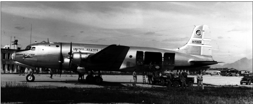
A C-54 unloads at Kimpo Airfield, September 1950.

The invasion of Inchon got underway on September 15. Taken by surprise, the enemy offered only light opposition. Three days later, advance elements of