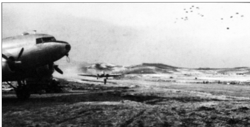
Operations at Hagaru-ri airstrip, December 1950. A C-47 at the left is being loaded with wounded as the C-47 in the background begins its takeoff. The C-119 overhead is dropping supplies.

The 5th and 7th Regiments of the 1st Marine Division reached Yudam-ni, about halfway up the west side of the Chosin Reservoir and 14 miles from Hagaru-ri, on November 25. Three infantry battalions and one artillery battalion of the 7th Infantry Division simultaneously advanced along the east side of the reservoir. Meanwhile, the 1st Marine Regiment protected the main supply route from Hagaru-ri to Koto-ri. Enemy opposition had been light throughout the advance.