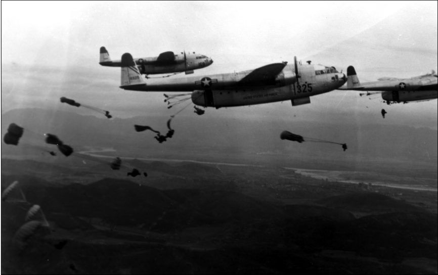
Airdrops over Sunchon, October 20, 1950

October 10, plans were finalized for a drop in the Sunchon-Sukchon area, 35 miles north of Pyongyang. The aim of the operation was to seize critical road junctions and cut off retreating enemy forces. Planners also hoped that U.S. prisoners of war (POWs) might be liberated from the trapped North Koreans.