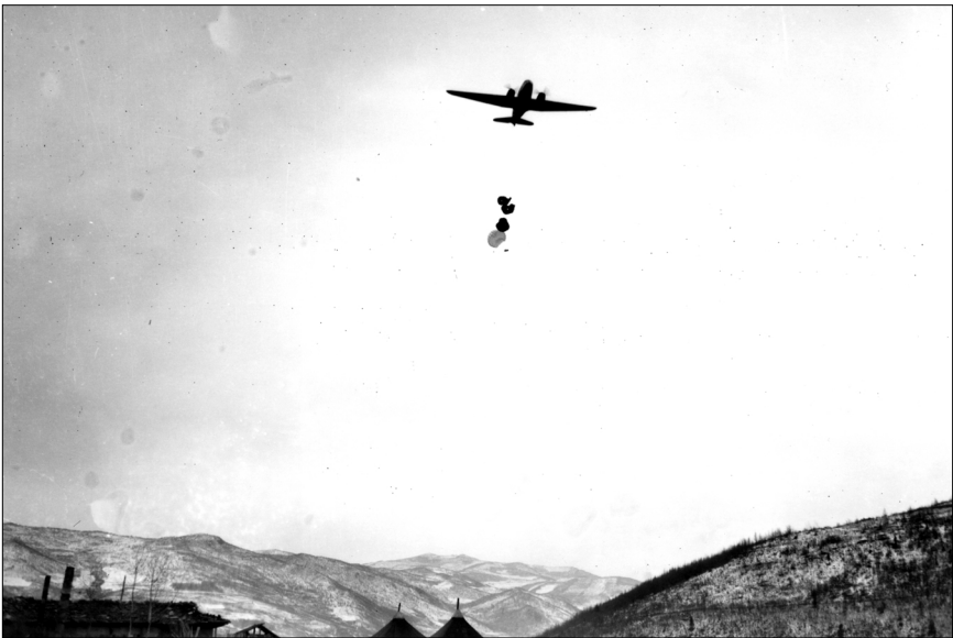
A C-47 making an airdrop at Yudam-ni, November 29, 1950.

Maj. Gen. Oliver P. Smith, commander of the 1st Marine Division, recognized that it was essential to hold Hagaru-ri if his men were to escape the Chinese trap. On November 28, he had ordered a relief convoy sent from Koto-ri to Hagaru-ri. Task Force Drysdale, however, was ambushed by Chinese troops on November 29. It lost 162 men killed or missing and 159 wounded, plus 75 vehicles. Nonetheless, a portion of the force—some 400 U.S. marines and Royal Marine Commandos—managed to escape. "The casualties of Task Force Drysdale were heavy," Smith acknowledged, "but by its partial success