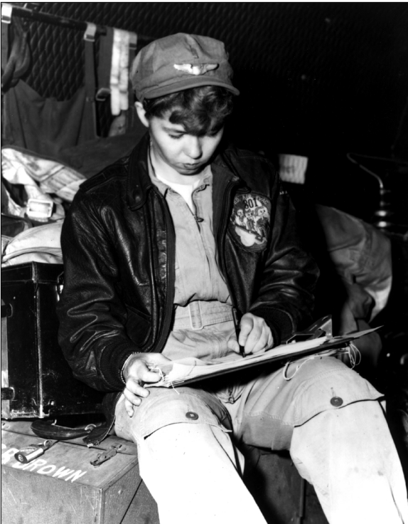
A flight nurse with the 801st Medical Air Evacuation Squadron, above , offers a cigarette to an evacuee of the Korean War during a C-124 flight in December 1952. Another nurse from the same unit completes paperwork, this during a C-54 flight in May 1952.