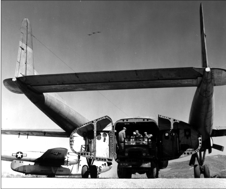
A C-119 is unloading a jeep at an advanced air base in Korea.

gistical situation, and the efficiency with which the officers and airmen of Combat Cargo Command carried out the highly important operation again demonstrates the close cooperation that exists between ground and air in the Korean War.”