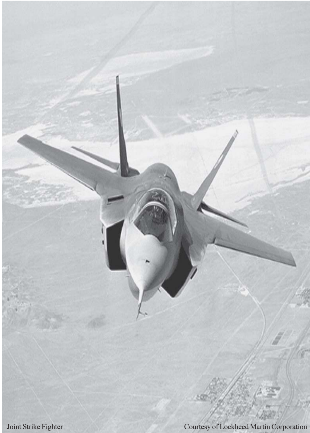
Joint Strike Fighter