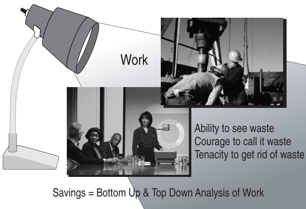
FIGURE 3. LEAN PROCESSES WITH SIX SIGMA CAPABILITY

As VSMs became widely used across Lockheed Martin and events were more clearly linked to operating plans and business objectives, each business set up another important facet of its infrastructure— Leadership Excellence Councils . Comprised of senior leaders within each business, these councils meet regularly to discuss LM21 progress and determine where resources should be allocated to have the biggest impact in the business. The councils also assign the talent (in this case, Green Belts and Black Belts) to lead and facilitate successful events and commit resource allocation when new opportunities are uncovered.