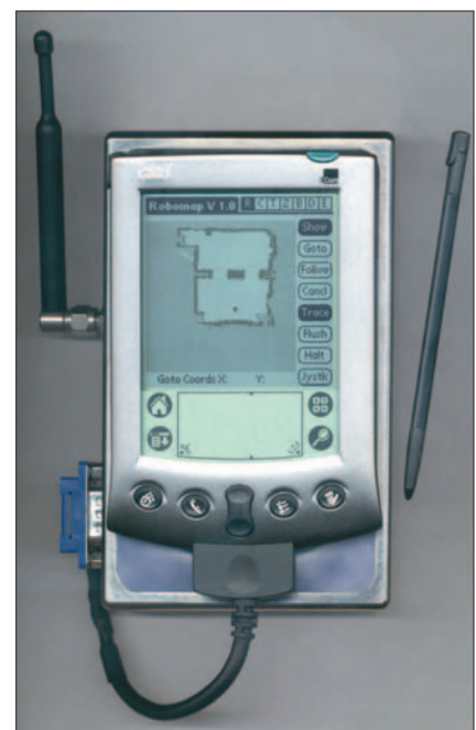
Figure 3. Users can enter commands through a Palm Pilot, which presents a map of the robot's environment.

(see Figure 3). 6 Through the PDA, users can directly give a limited set of commands to the robots. They can tap on menu buttons