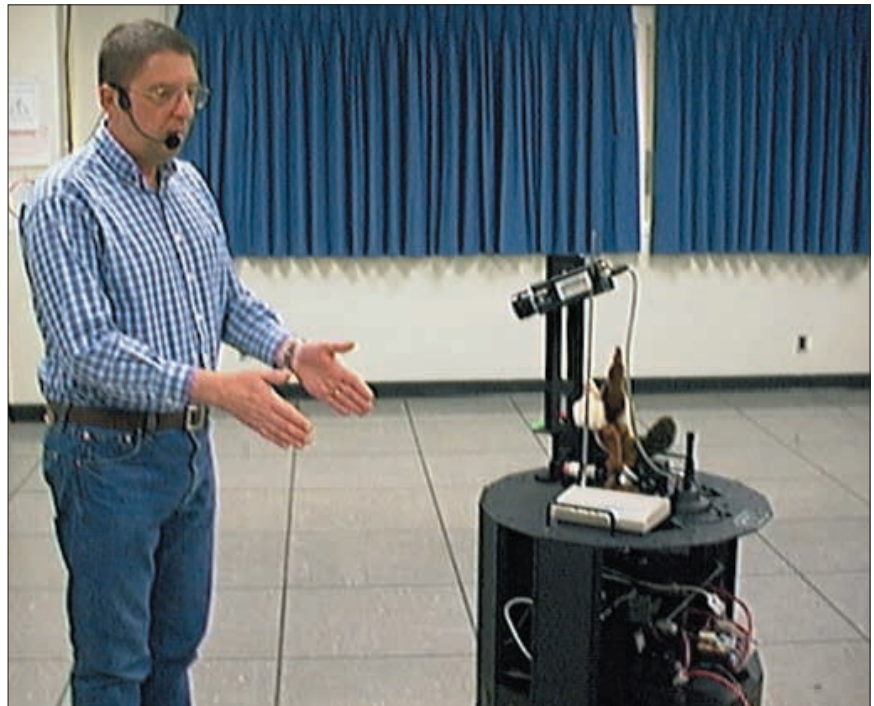
Figure 2. A researcher interacts with Coyote, one of the mobile robots, using natural language and gestures.

People gesture while they speak. Some gestures are meaning-bearing, some are superfluous, and others are redundant. Some gestures indicate the speaker's emotional or intentional state. Our multimodal interface deals with only meaning-bearing hand and arm gestures that disambiguate locative elements referred to during human-robot interaction. For example, when someone says "Go over there," the utterance is meaningless unless that person gestures to the physical location. Our interface interprets natural gestures , those made with the arm or hands (see Figure 2), and mechanical gestures , those made by pointing