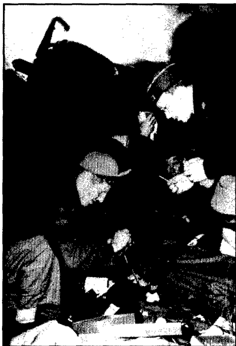
Aeromedical pre-evacuation rescue efforts at crash sites helped save lives.