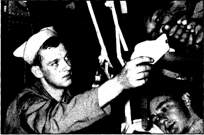
An AAF medic checks a wounded soldier's identification tag during an evacuation flight.

roads, or railways. Motor ambulances took twelve to fifteen hours to reach the nearest medical facility in Constantine, Algeria, and hospital trains took twenty to twenty-four hours; air evacuation took only one hour. Larger hospitals in Algiers and Oran were only ninety minutes away. In the last attack on Tripoli, almost all patients were evacuated by air. Patients seriously ill or injured departed on air ambulances, and patients with minor injuries left on transport planes. Although still new and imperfect in some respects, aeromedical evacuation quickly proved its worth.