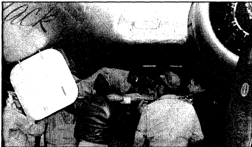
A crewman, wounded by flak during an Eighth Air Force bombing attack over a heavily defended German industrial target, strains against the escape hatch of the B-17 Flying Fortress "That's All Jack" as medical personnel transfer him to a waiting ambulance.

Medics at High Wycombe also helped prevent anoxia deaths at high altitudes. These deaths were caused both by inadequate training with oxygen equipment and by the faulty design of the first AAF oxygen masks, which often froze up at high altitudes (above 25,000 feet) and shut down the oxygen flow. Most anoxia deaths occurred among recently arrived crew members, whose lack of experience at high altitudes sometimes caused their oxygen masks to disconnect from the hoses. Training in the proper use of oxygen equipment began in March 1943 at the school unit at High Wycombe. High-altitude flights in training chambers were made available to almost everyone in the Eighth Air Force, including the medical staff, and training exposure to the first stages of hypoxia (shortage of