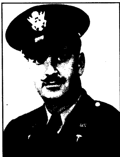
Colonel Harry G. Armstrong