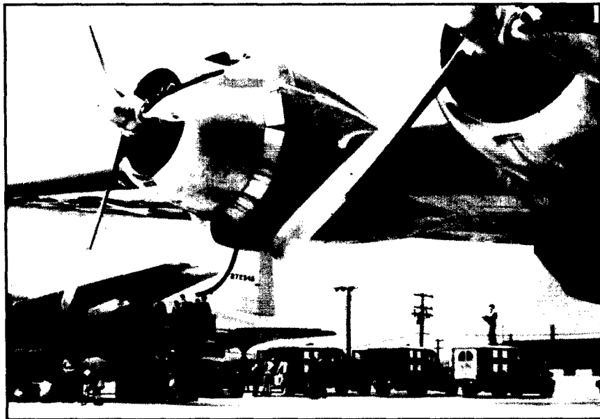
C-54 Skymasters like those shown here evacuated thousands of combat casualties from Great Britain.