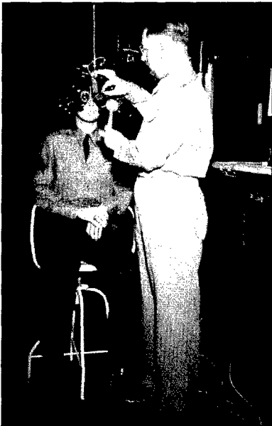
Testing flight training candidates was another AAF medical system task on the homefront. Here, a doctor assesses a potential airman's eye muscle balance using a green refractor.

Administering a standard test soon became tedious and boring to most volunteer doctors, so the AAF gave each of them an opportunity to learn the more advanced skills of a flight surgeon. The didactic classes were administered by the School of Aviation Medicine (SAM) at Randolph Field, Texas. The subjects were general aviation medicine and AAF medicine, including nutrition, physical fitness, and convalescence. To show some of the physical and mental stresses of flying, the program after July 1944 included an introduction to flight, including some hours in