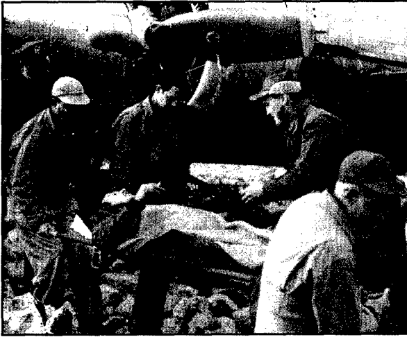
A crew member of the 379th Bomb Group, wounded during a mission over enemy territory, is removed from the plane by an ambulance crew at an Eighth Air Force base in England in May 1944.

resisted this policy, in keeping with Air Surgeon Grant's views. General Grant wrote that medical care of AAF personnel "does not end with the squadron Flight Surgeon, but that to assure the maintenance of the striking force of the air command, medical service must include hospital, sanitary, and daily hygiene inspection facilities." In August 1942, Colonel Grow got permission to operate AAF rest homes for patients with flying fatigue. When the air surgeon later tried to convert them into de facto AAF hospitals, the Army's theater command denied the request.