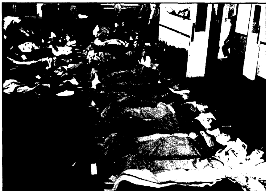
In the “ready-room” at an air base in Great Britain, wounded Americans wait to be transferred to the C-54 Skymaster that will take them to Army hospitals close to home.

The limited air evacuation expansion was inadequate to meet all medical needs. By late September, a backlog of almost 7,000 patients on the Continent prompted the theater surgeon to resubmit the proposals for a dedicated air evacuation force. But the chief of staff in Europe, Lt. Gen. Walter B. Smith, again rejected the idea and directed the surgeons to consider air evacuation “a bonus to be available from time to time as conditions permit.” When Lt. Gen. Omar N. Bradley, the commander of the Twelfth Army Group, asked for dedicated air evacuation, Smith again rejected the idea and wrote that “any evacuation system based on air transport will break down.”