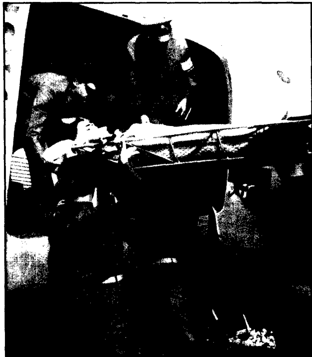
A wounded airman is lifted into a Douglas C-39 air ambulance for transport to a hospital.