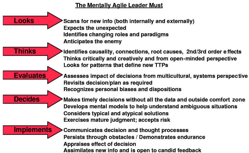
TABLE 2 43

According to the Agile Leader's Study being conducted by the U. S. Army War College, the following attributes are essential for future Army leaders. 42