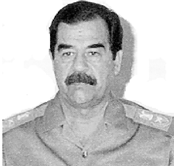
Figure 2. Iraq's President Saddam Hussein