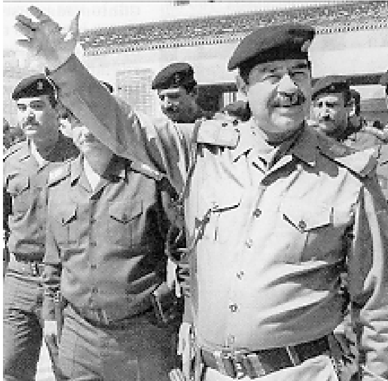
Figure 4. Saddam Hussein Greets Iraqi Troops

Gulf War, and produced ammunition, small caliber weapons, and mortars. Iraq also successfully incorporated captured Kuwaiti equipment into its operational inventory (a violation of UN resolutions requiring return of captured Kuwaiti equipment). 27