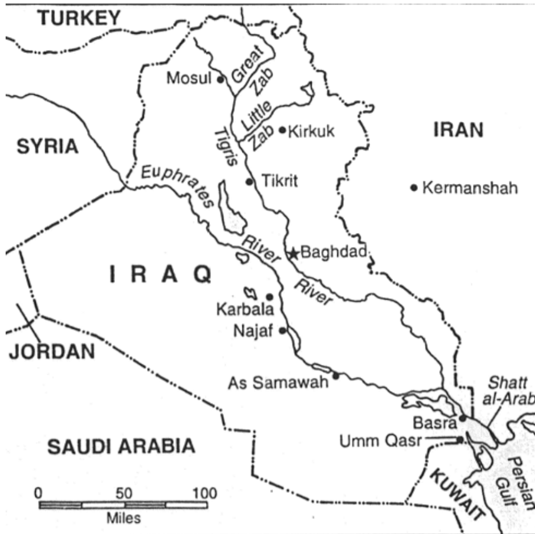
Figure 1. Map

UNSCR 660 required Iraq immediately withdraw its forces from Kuwait to their positions on 1 August 1990. Saddam Hussein disregarded UNSCR 660 and continued Iraq's occupation of Kuwait, and the human suffering that it brought. He effectively usurped the authority of the legitimate Government of Kuwait and purported a "comprehensive and eternal merger" 3 of Kuwait with Iraq. His proclaimed annexation of Kuwait as the "nineteenth province" of Iraq announced to the world that he had no intentions of retreating from Kuwait. 4 In fact, Hussein gave up all the territory Iraq gained