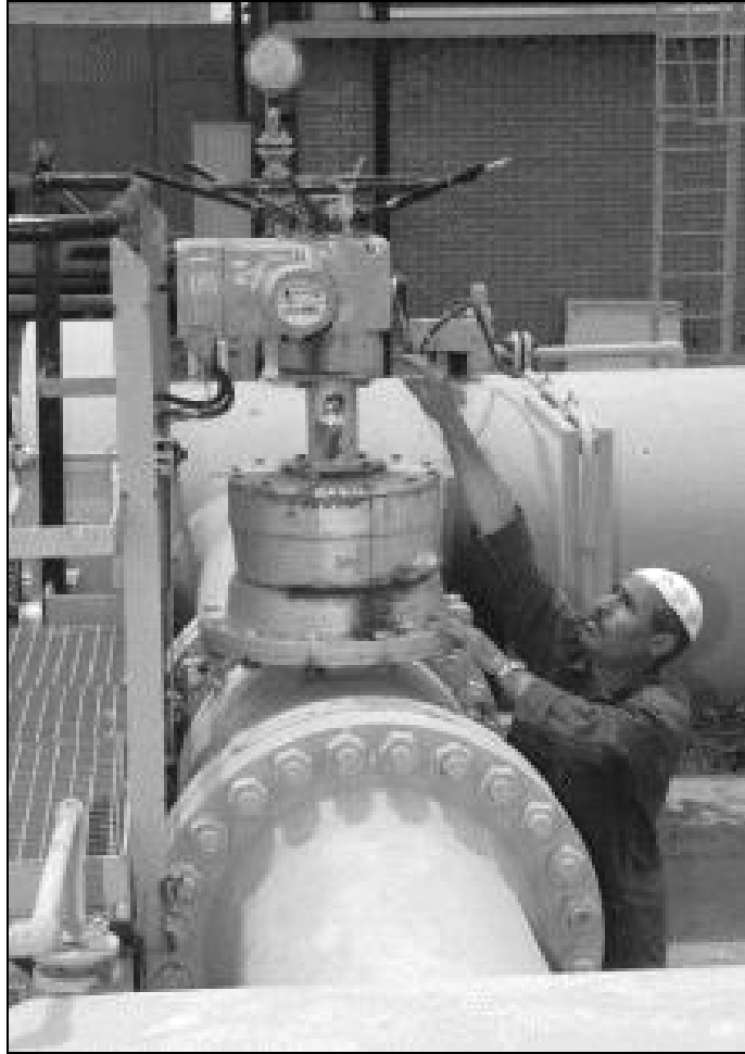
Figure 3. Iraqi Workman at Oil Pipeline Station at Kirkuk

The implementation of UNSCR 986 should relieve some of the human suffering in Iraq. It should not, however, be construed as a lifting of the sanctions against Iraq. Then US Ambassador to the United Nations, Madeline Albright, emphasized that “the sanctions regime is fully in place and there is business as usual on that until Saddam Hussein lives up to all the obligations that are required of him under the resolutions of the Security Council.” 16