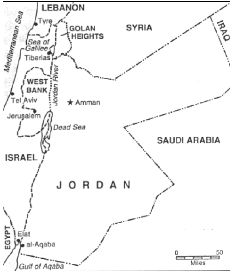
Figure 5. Map

The port of Aqaba is Jordan's only port. Aqaba is located at the south of Jordan and along the northeastern shore of the Gulf of Aqaba, which connects Jordan to the Red Sea. During its over 57 year history, the Port of Aqaba prospered largely due to Jordan's strategic location as a crossroads between the Middle east, Africa, the Mediterranean Sea, and the European continent. The port activity peaked in 1988, when Aqaba serviced 2500 ships and handled about 20 million tons of cargo (Table 7). However, the eruption of the Gulf crisis in 1990, the subsequent UN sanctions against Iraq, and the blockade of the port of Aqaba sent port activity into a sharp decline, largely because the port activity is so largely linked to Iraq. In 1989, prior to the Gulf crisis, the port handled about 10 million tons of exports, 71% of those goods were for Iraq. Since the sanctions, cargo destined