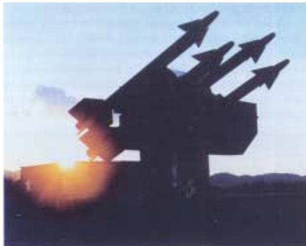
Figure 3. Chaparral

The Chaparral provides protection against low-flying helicopters, and propeller-driven and speed jet aircraft. It is employed to provide air defense of the division, theater and Army service area, and key airbases and installations. Often teamed with the Vulcan air defense gun, Chaparral's full-tracked chassis allows it to cross lakes, streams and rough terrain. An aggressive product improvement program has maintained Chaparral's reputation as one of the deadliest Air Defense Artillery weapon systems on the battlefield. A new forward-looking infrared radar has improved Chaparral's night vision, allowing it to fight effectively at night as well as in daytime. A platoon leader commands four Chaparral missile systems.