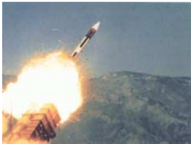
Figure 5. Patriot

Recently deployed to Europe, Patriot is the most sophisticated weapon system in the Army inventory. Highly mobile and capable of engaging multiple targets simultaneously, Patriot provides air defense against aircraft flying at medium to high altitudes. A product of a 15-year test program, the system has a high single-shot kill probability and can operate in an intense electronic countermeasure environment. Its high mobility allows it to move within 30 minutes after receiving a march order. Once it reaches its destination, Patriot can be set up within 45 minutes.