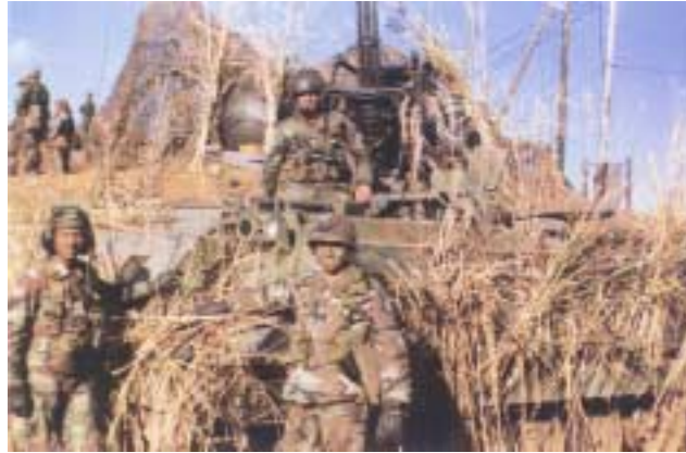
Figure 4. Vulcan

Designed to fight off low-flying aircraft, the Vulcan's rotating 6-barrel cannon fires at a rate of 3,000 rounds-per minute. The self-propelled version is mounted on a fully tracked armored personnel carrier. The towed version is standard equipment for Air Defense Artillery units attached to light divisions and airborne units. A second lieutenant assigned to a Vulcan platoon in a mechanized division will lead four Vulcans in support of a battalion-size combined arms team.