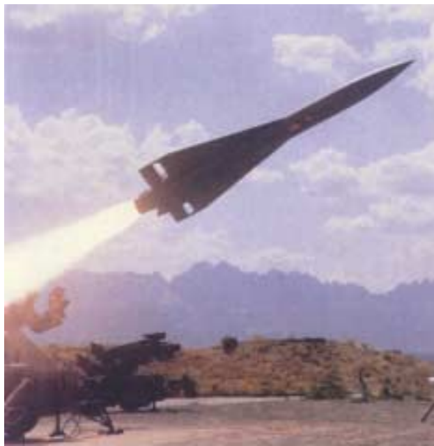
Figure 6. Hawk