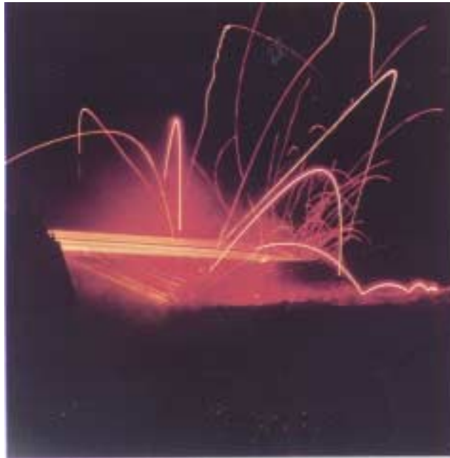
Figure 1. Mission

If you are seeking an opportunity to be a leader in a combat arm, and at the same time develop skills in the employment of highly advanced weapon systems, pinning on Air Defense Artillery's cross cannons and missile insignia is a step into that future — a future which promises you challenging assignments, rapid career advancement and a chance to serve your country.