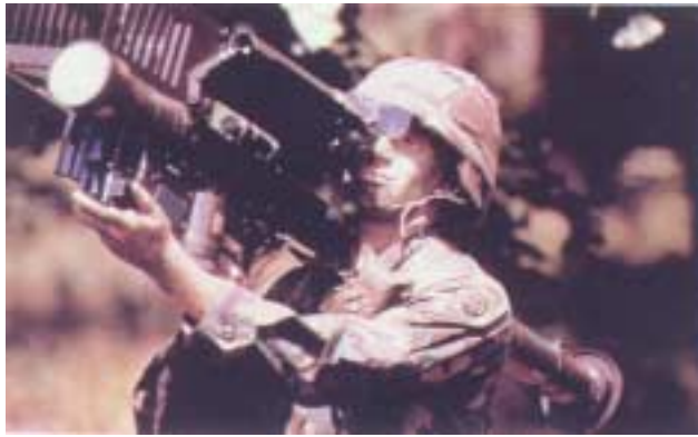
Figure 2. Forward Area Air Defense/High-To Medium-Altitude Air Defense