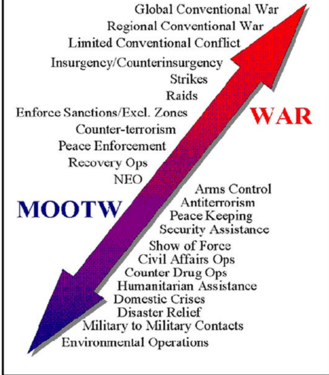
Figure 2. Spectrum of Conflict