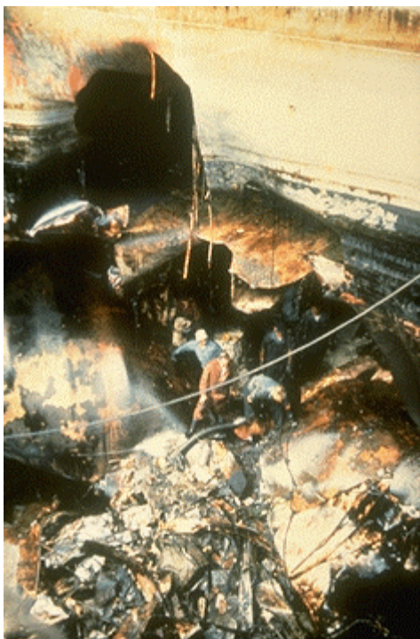
Figure 3 View of torpedo hole below waterline. 42