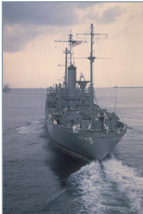
Figure 1 USS LIBERTY before the attack (stern view). 10