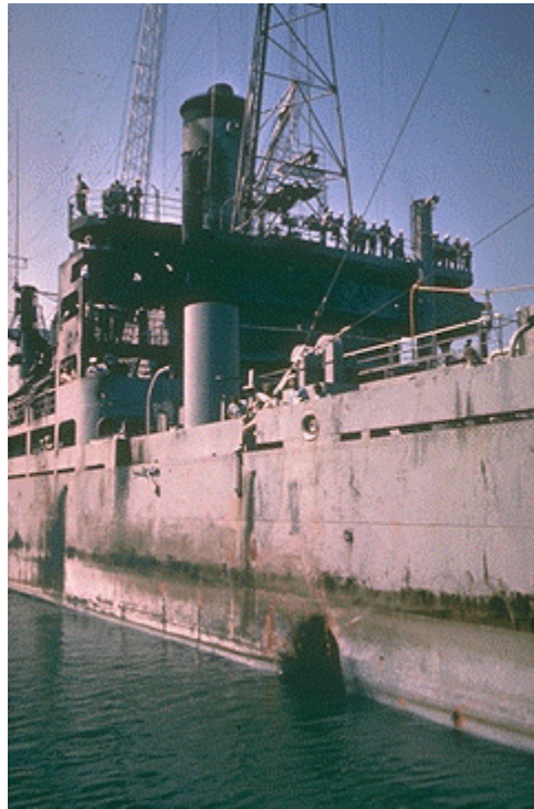
Figure 2 The very top of the torpedo hole. 32

Your flash traffic received. Sending aircraft to cover you. Surface units are on the way. Keep [situation reports] coming. 31