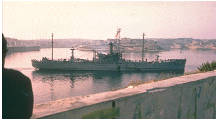
Figure 4 USS LIBERTY silhouette. 21

Additionally some of the Israeli versions of the attack claim the LIBERTY was mistaken for the Egyptian motor vessel, El Quesir. The two vessels were not similar. The key silhouette features that distinguished one from the other include the antennae arrays and the differing superstructures. LIBERTY was approximately twice the length of El Quesir. The Israelis probably knew that El Quesir was in Alexandria during the entire Six-Day War. Alexandria is 250 miles from where LIBERTY was patrolling, 24 hours steam away. 20 Comparison may be made below.