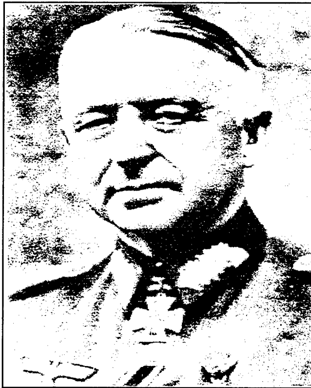
ERICH VON MANSTEIN

There have been many great military leaders throughout history. It is to be expected in a world filled with conflict where military power has become the premier method of resolving disputes. One of the finest military leaders in recent history was Germany's Erich von Manstein. Though not the father of the Blitzkrieg, he was undoubtedly the most able in its execution. One of the best examples of military operations conducted at the operational level of war was that of Field Marshal von Manstein's Army Group South (formerly Army Group Don) on the Russian Front from November 1942 through March 1943. With limited resources, a large front and facing vastly superior enemy force, Manstein was able to regain hundreds of miles of territory and inflict tremendous losses to the Soviets. His most brilliant operation was during the battle for the city of Kharkov in late February and early March 1943.