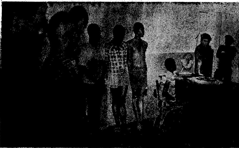
White man relied on cocaine ring for amount of 2 million cruzeiros