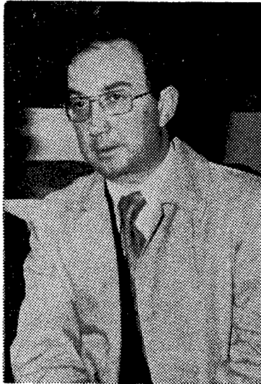
Carlo Tognoli, sindaco di Milano.