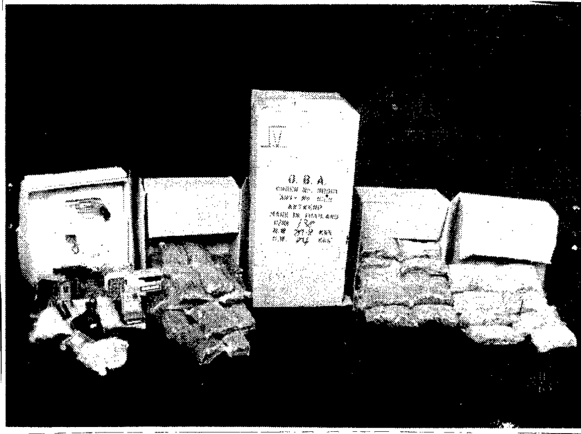
Boxes of rubber bands in which Dutch agents found part of the 126-kilogramme heroin haul.