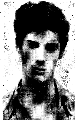
Radichetti Scлагione Ronco