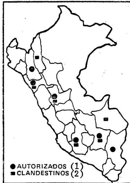
Production Has Increased Since 1964