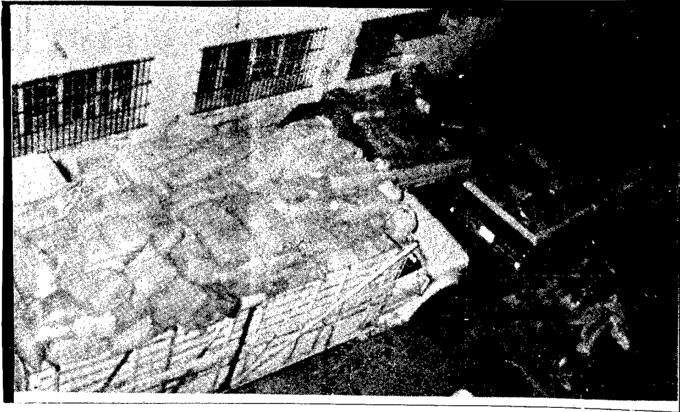
A fully loaded "Torton" truck and three pickup trucks were confiscated by the Federal Judicial Police in a ranch near Ciudad Mier.