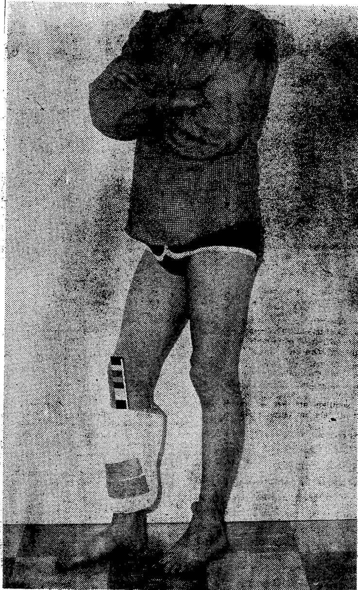
When police arrested the narcotics courier at Stockholm's Central Station, he had the narcotics in a bandage on his leg. The bandage was concealed under his wide trousers.