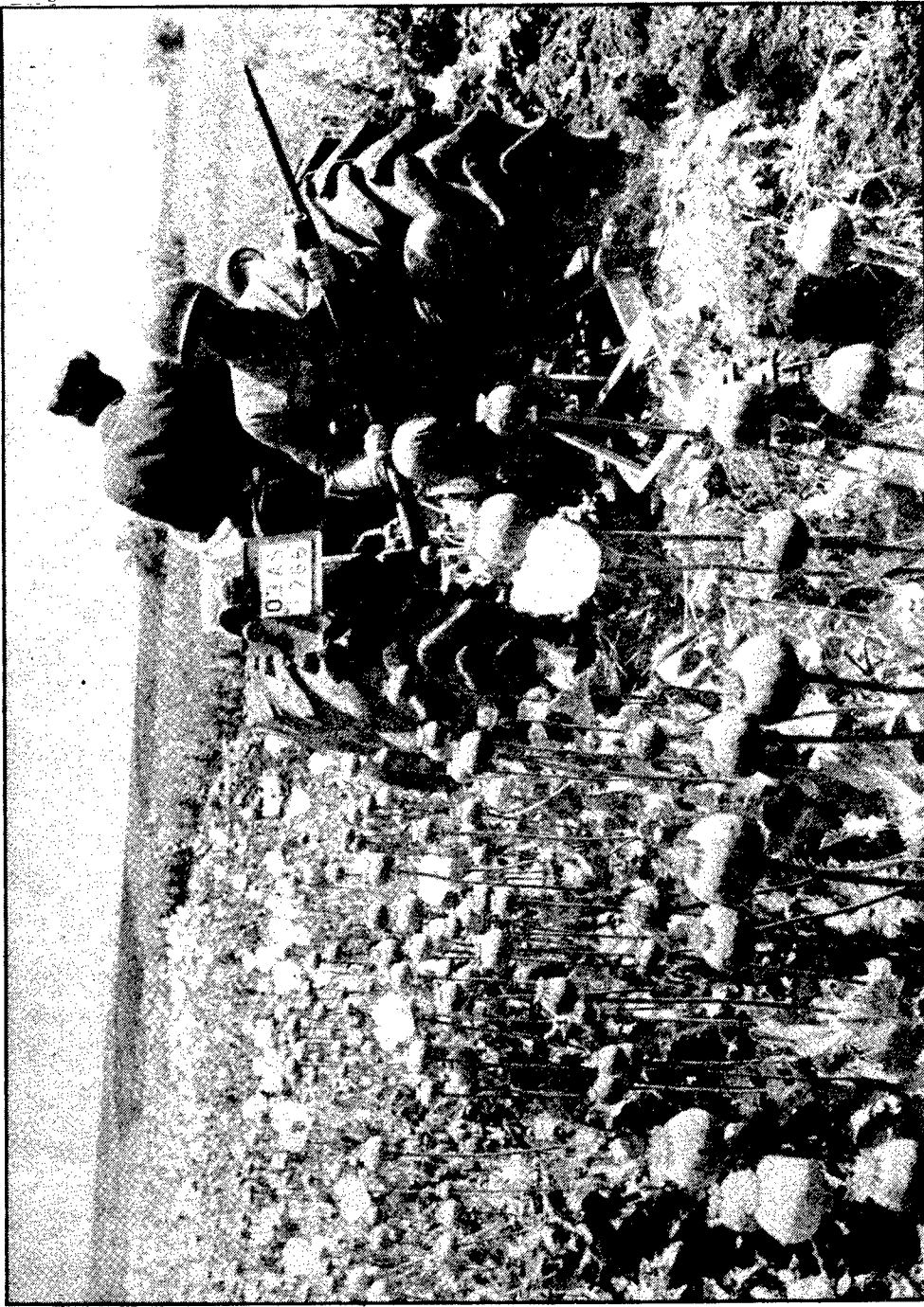
A Turkish farmer ploughs through his opium crop while a soldier keeps guard