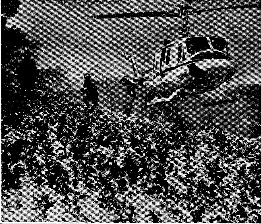
Mexican soldiers jump from a helicopter onto a poppy field in Sinaloa, as part of "Operation Condor," whose mission is to stop the production of heroin and marihuana in northwest Mexico.