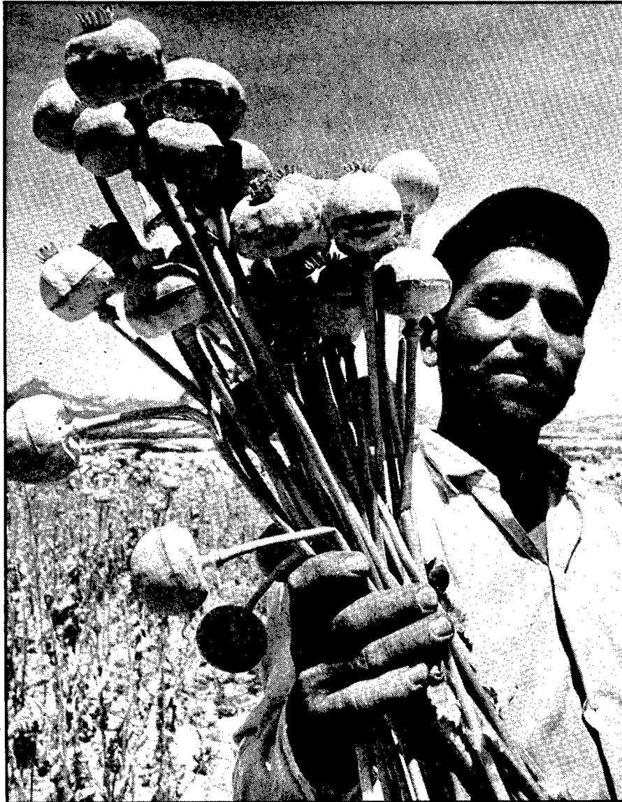
Turkish peasant shows some of his poppy crop, with each flower cut to drain the opium liquid which provides his main income