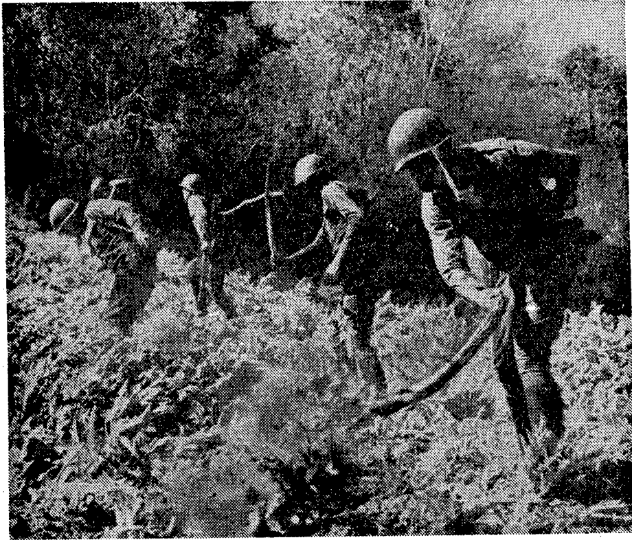
Soldiers of "Operation Condor," of the Mexican Army burned poppy fields yesterday and established controls to arrest the drug traffickers.