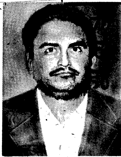
Abimael Guzmán "Comrade Gonzalo"

[Answer] We do not waste our time with them. Their masses will follow us; their leaders are traitors, and we shall treat them as such.