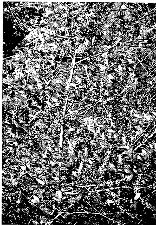
Figure 1. Close-up yaupon ( Ilex vomitoria ), showing leaves and fruit (top) and branches heavily laden with drupes in late fall (bottom)