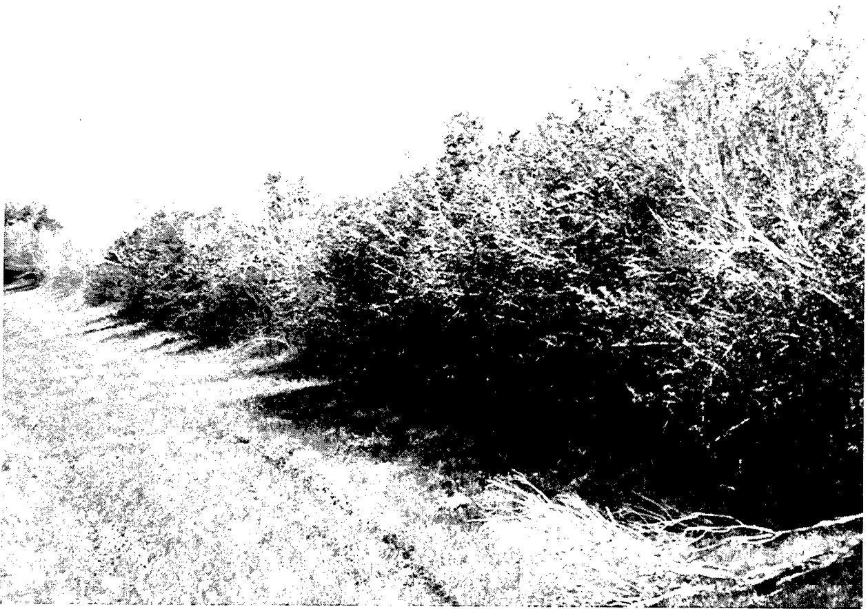
Figure 2. Yaupon thicket along a roadside in south-central Texas

on sites subjected to winds, limited salt spray and, in some instances, moderate amounts of salt in the soil (Wigginton 1963). Yaupon grows well in shade and sun, but best growth and maximum fruit production occur in open areas (Halls 1977).