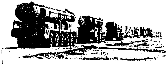
Fig.1 Russian SS-N-20 Submarine Fired Ballistic Missile

At the present time, a good number of nations all are in the process of carrying out various types of ballistic and cruise missile projects. There are approximately 34 nations or regions that are equipped with intermediate range ballistic missiles. The ranges of these missiles are between 70-4750km. These old model missile systems--for example, Puludong (phonetic), MGM-52 Lance, and SS-1 Fleet Footed Runner (SCUD)--will be very rapidly retired from service. What is adopted to replace them is a large number of newly developed missiles.