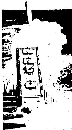
Fig.3 Tomahawk Missile Launched Aloft

During the 1991 Gulf War, cruise missiles played an important role. As a result, a number of countries will, in the 1990's, seek to develop similar missile systems.