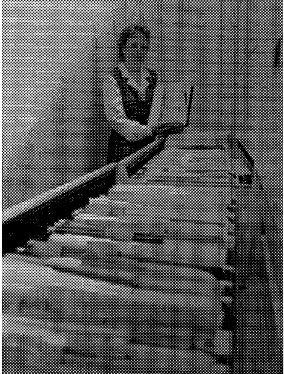
Figure 1: Paperwork Reduction Resulting From Facilitywide Permit

A representative of a New Jersey pharmaceutical manufacturer holds the binder containing the single facilitywide permit that replaces voluminous medium-specific permits.