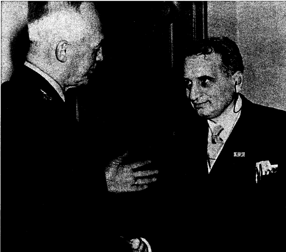
Figure 1. Five Star General Hap Arnold thanks Dr. Theodore von Kármán following the completion of the first Airpower S&T report. The report, Toward New Horizons , was submitted on 15 December 1945.