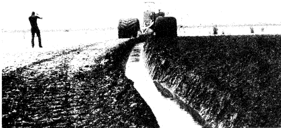
Figure 2. Construction of trenches at Savannah

The Savannah District does not recommend purchasing prototype equipment for dewatering activities. Some prototype equipment the Savannah District used broke down, needed frequent repairs, and did not work as well as advertised. The Savannah District would like to use equipment with lower ground pressure than is currently in use. Their problem is the same as other Districts in that trenching is needed for dewatering, but some dewatering must occur before trenching can be accomplished.