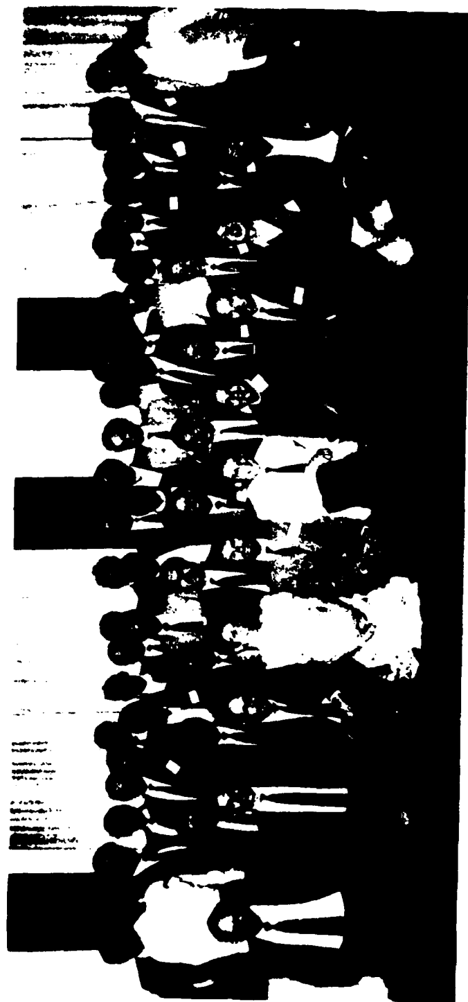
Participants of the 1990 IUTAM Symposium