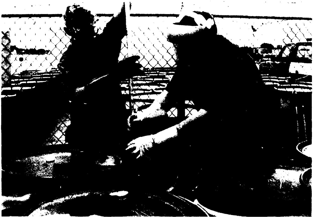
Figure: Survey Sampling Procedures