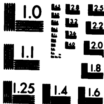
MICROCOPY RESOLUTION TEST CHART NATIONAL BUREAU OF STANDARDS-1963-A