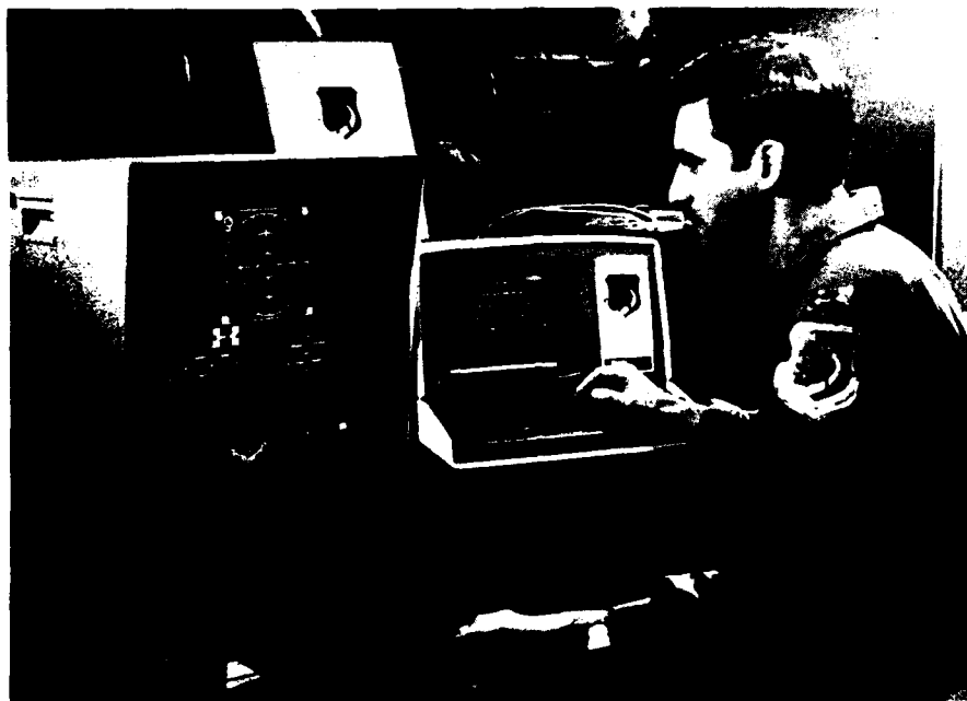
Figure 1. RWR SFT Station

The RWR SFT station (see Figure 1) was designed around a Cromemco Z80-based microcomputer. Additional hardware needed to complete the SFT station includes a specialized multi-plane color graphics system and color monitor, and a touch sensitive screen. This paper addresses the evaluation of one version of the ALR-69 for the F-16 aircraft.