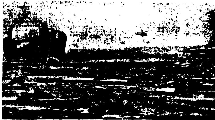
Light amphibious tanks (PT-76) disembarking from a landing ship of the ALLIGATOR-Class.