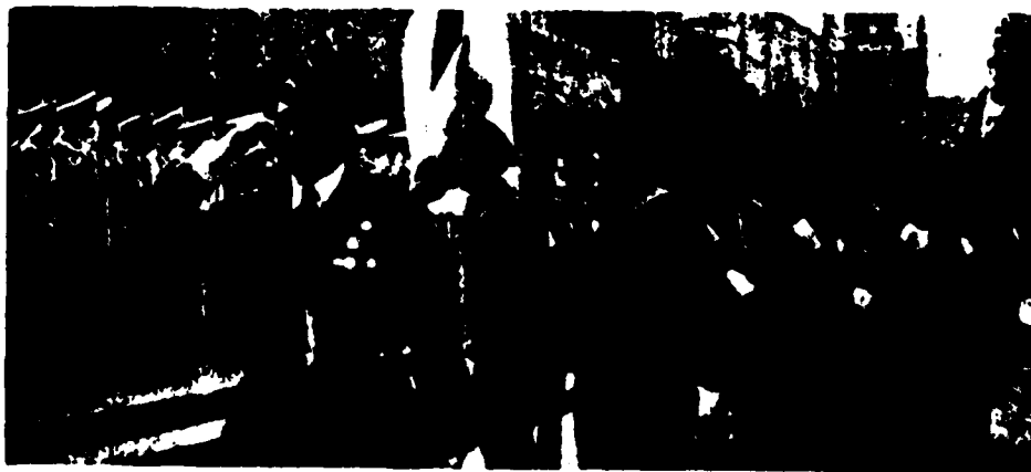
Parading Naval Infantry at the Kremlin Wall in Moscow

Out of the naval infantrymen and sailors of the Baltic Fleet, about 10,000 rebels were recruited from Helsingfors, Wyborg, and Kronstadt. These men became the first "Red" naval infantry of the October Revolution of 1917 and occupied key objectives in Petersburg (Leningrad) and stormed the seat of Kerenski's Provisional Government, the Winter Palace. Of course, it is concealed that the