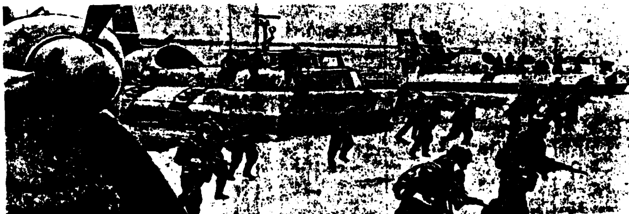
Naval infantry troops of the Baltic Red Banner Fleet disembarking from air-cushioned vehicles of the GUS-Class.

As independent tactical amphibious troops, they can perform missions such as occupying islands, harbors, naval bases, airfields in the vicinity of a coast, and perform small coastal patrols