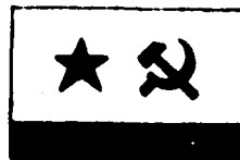
Armbadge and flag emblem of the Soviet Naval Infantry