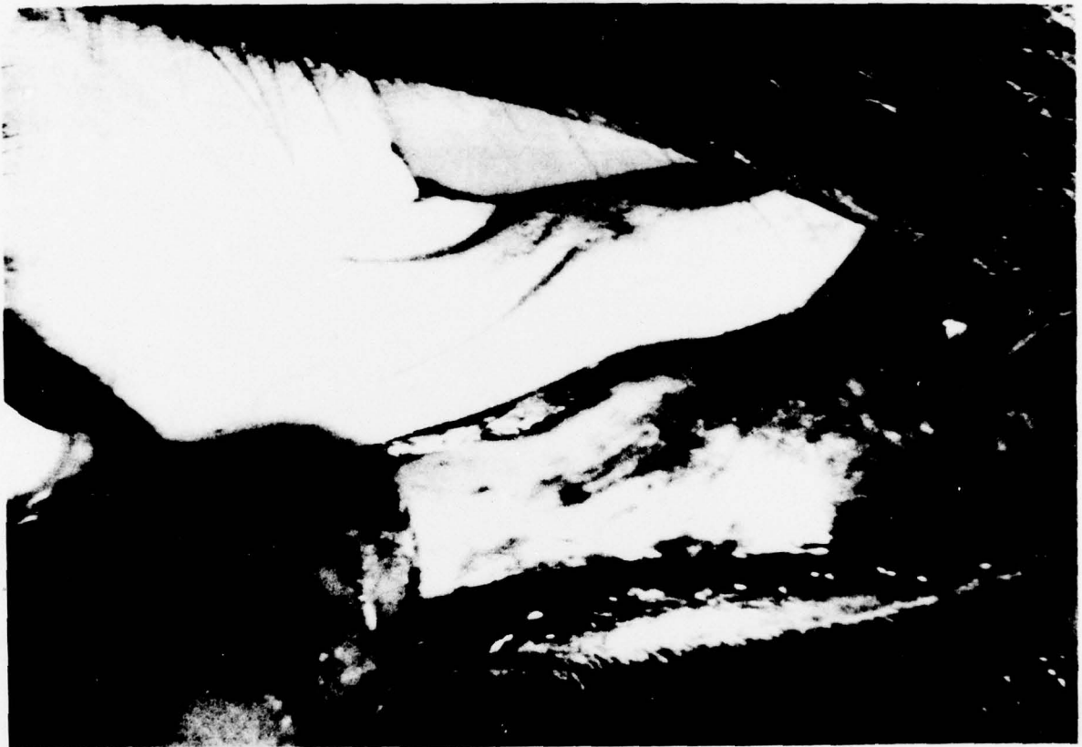
1. Preoperative view of edentulous body of mandible.

THIS PAGE IS BEST QUALITY PRACTICABLE FROM COPY FURNISHED TO DDC