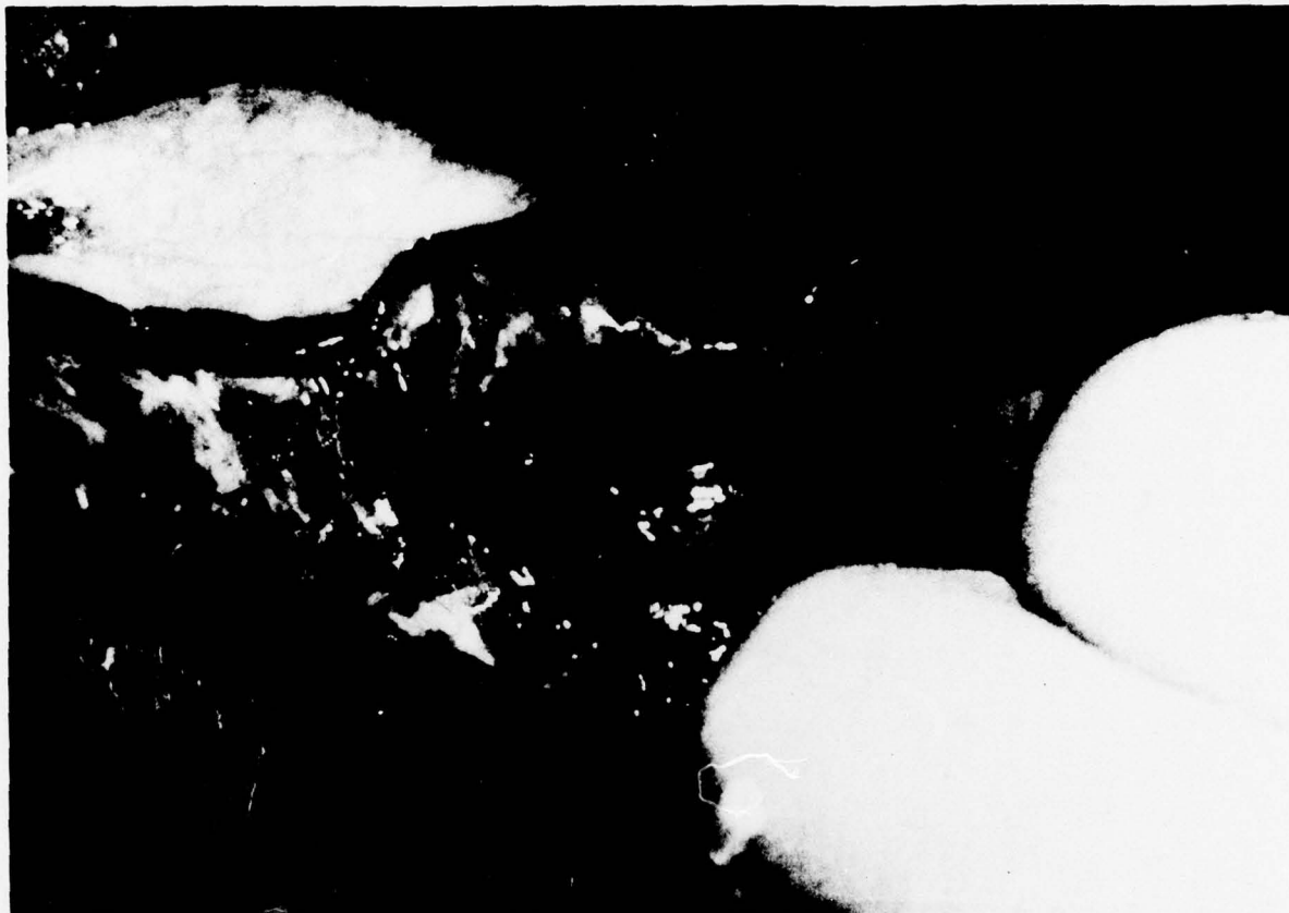
2. Augmented section of mandible 40 weeks after surgery.

THIS PAGE IS BEST QUALITY PRACTICABLE FROM COPY FURNISHED TO DDC