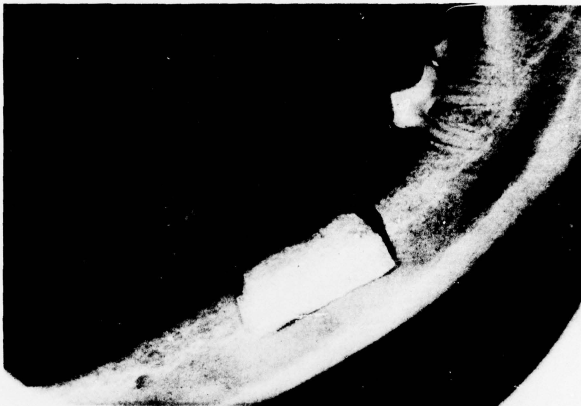
4. Radiograph of tricalcium phosphate covered with host cortex one month post insertion.

THIS PAGE IS BEST QUALITY PRACTICABLE FROM COPY FURNISHED TO DDC