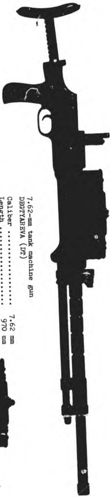
7.62-mm tank machine gun DEGTYAREVA (DP)