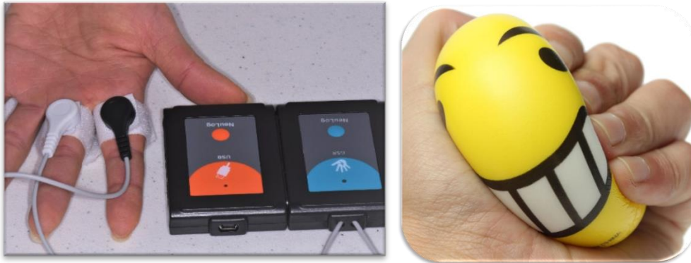
Figure 4: Data was collected using NeuLog 3 GSR software with a one-hour run time and a sampling frequency of 5 microsiemens ( \mu\text{S} ) per second.