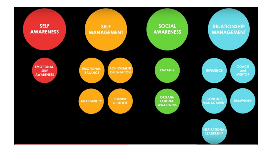
Figure 1. Critical Competencies of EI