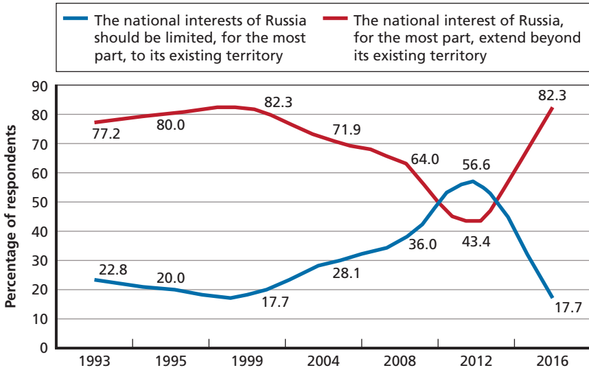
Figure 2.2 Survey Results on the Scope of Russia's National Interests